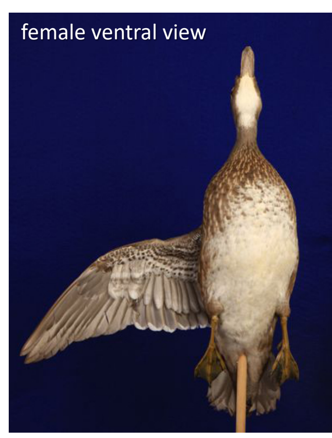
© Illinois Department of Natural Resources. 2020. Biodiversity of Illinois .