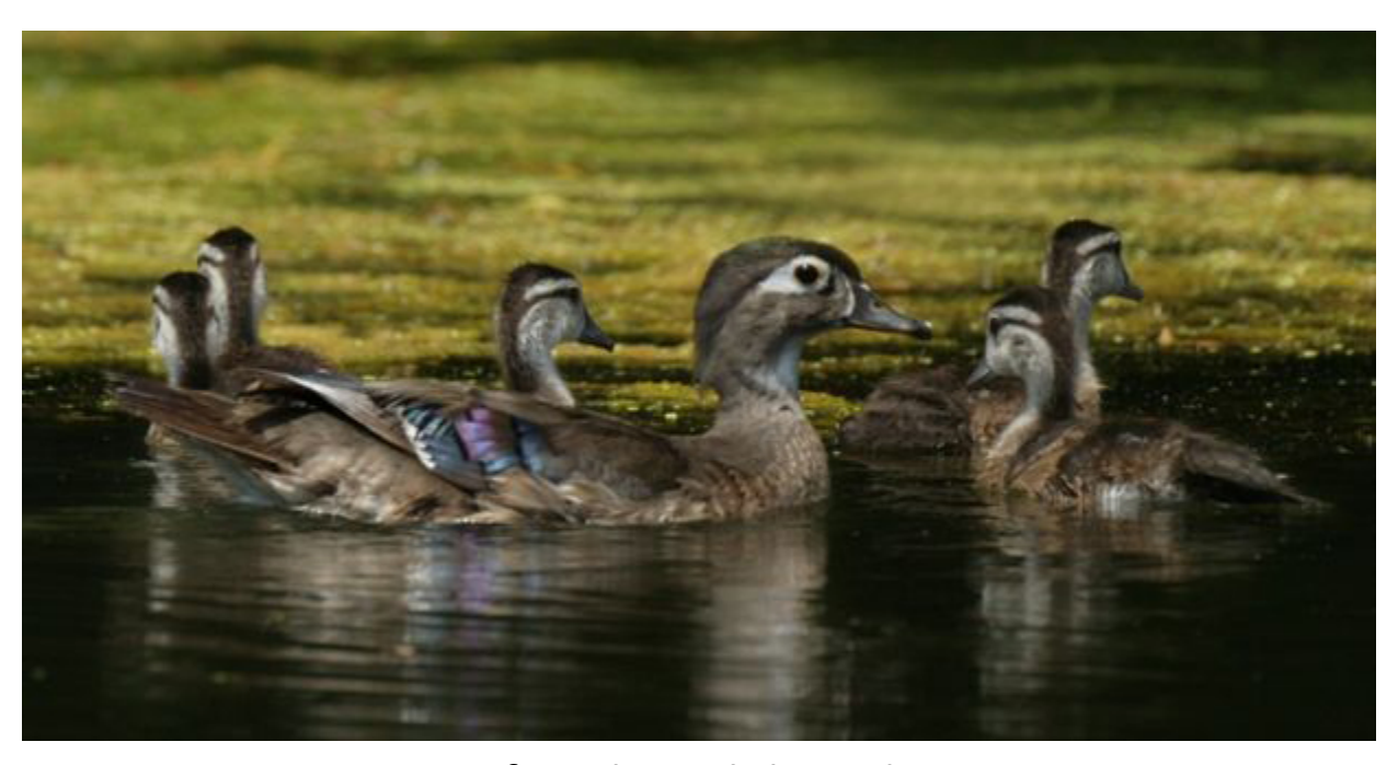
female with brood