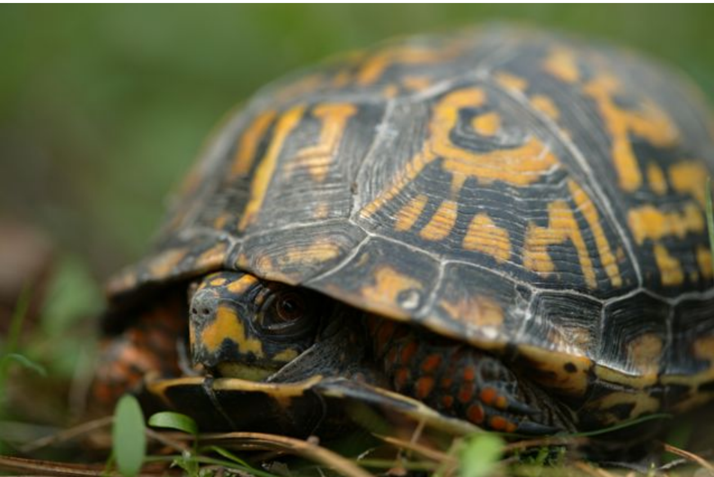
© Illinois Department of Natural Resources. 2020. Biodiversity of Illinois .