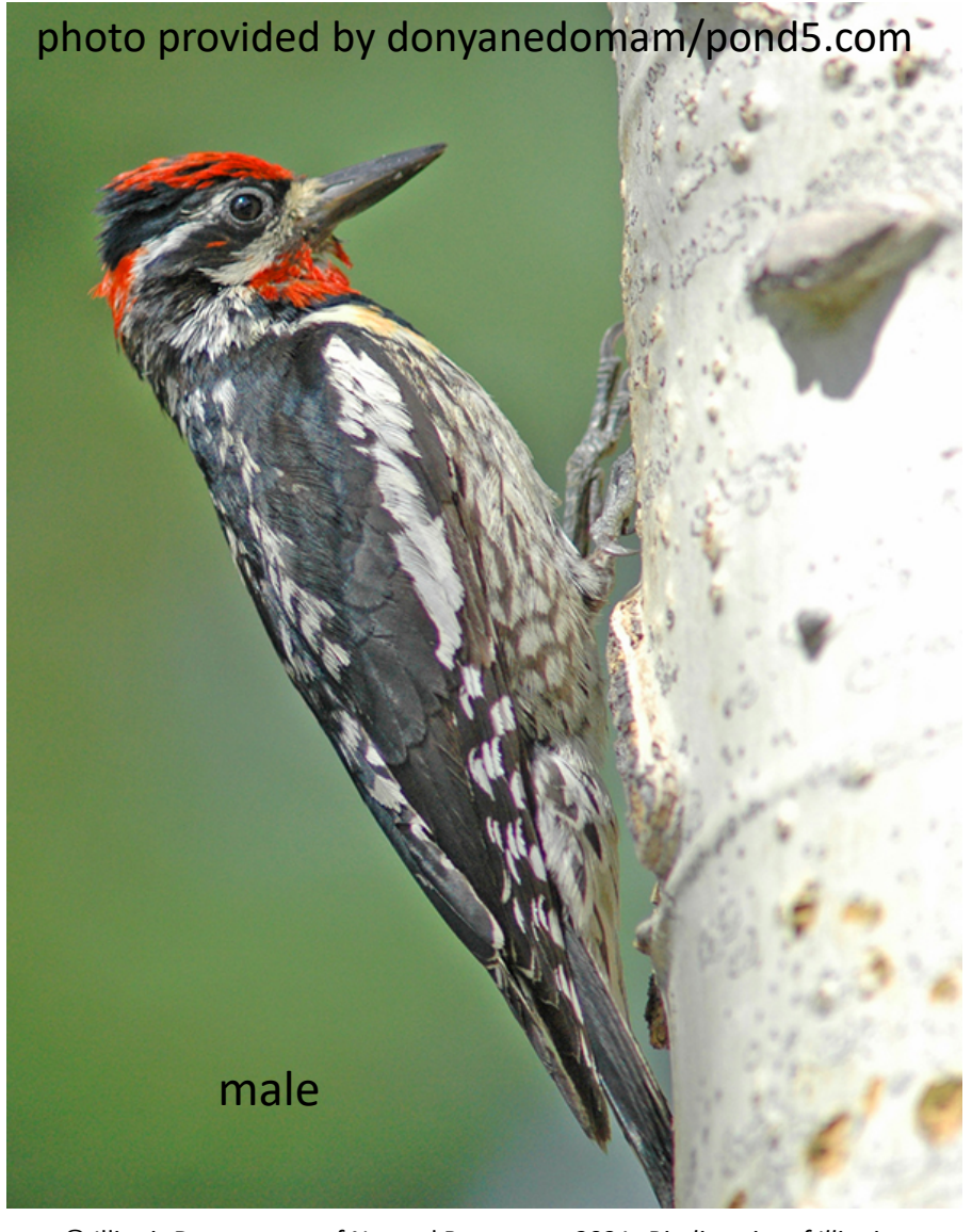
© Illinois Department of Natural Resources. 2021. Biodiversity of Illinois . Unless otherwise noted, photos and images © Illinois Department of Natural Resources.