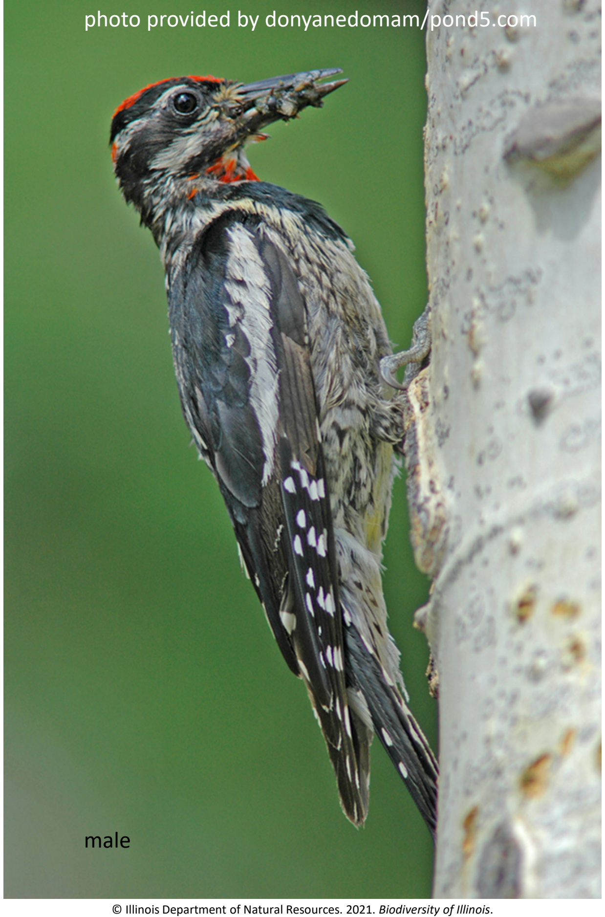
© Illinois Department of Natural Resources. 2021. Biodiversity of Illinois . Unless otherwise noted, photos and images © Illinois Department of Natural Resources.