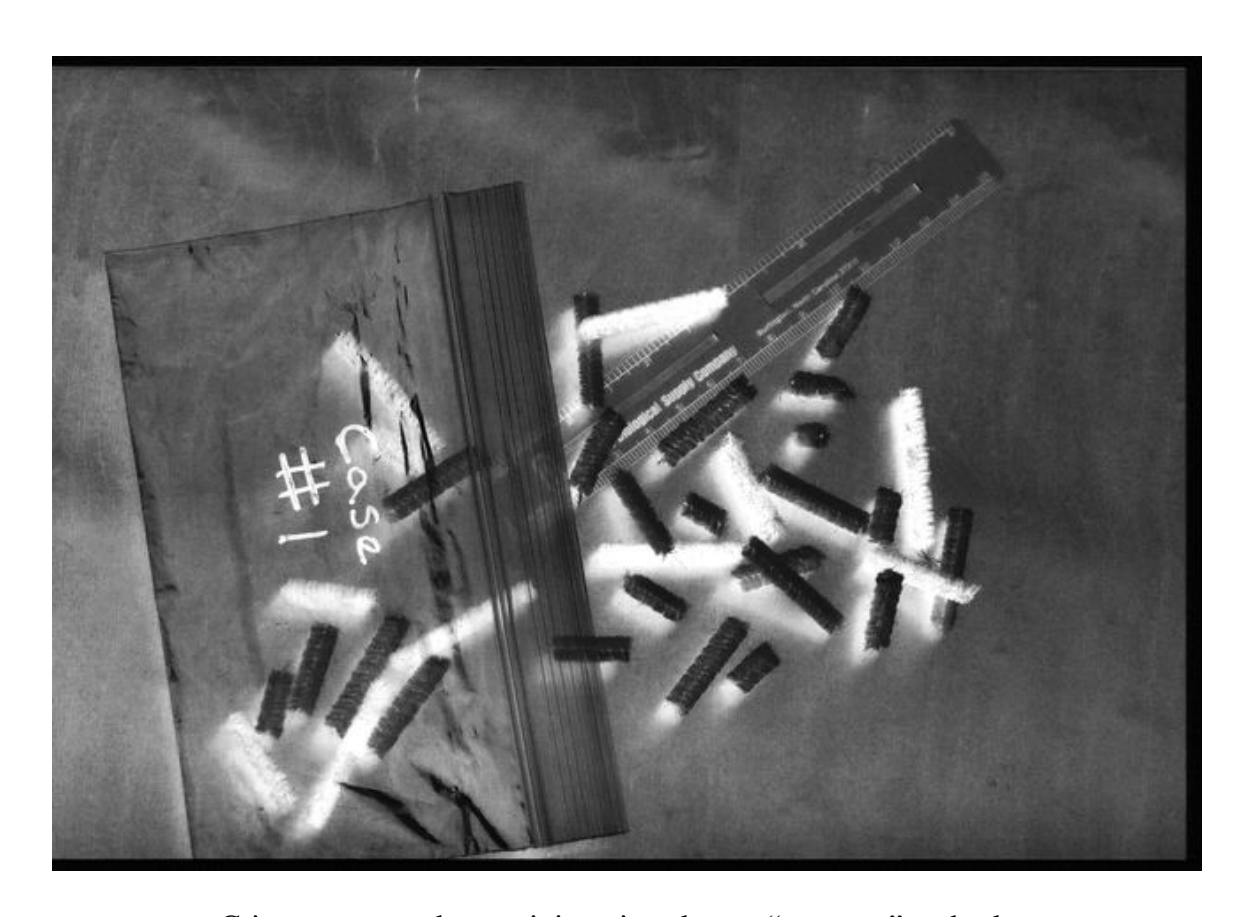
Crime report pack containing pipe cleaner "maggots" and ruler.

At the end of the activity, lead the group through the "Let's Talk About It" questions.