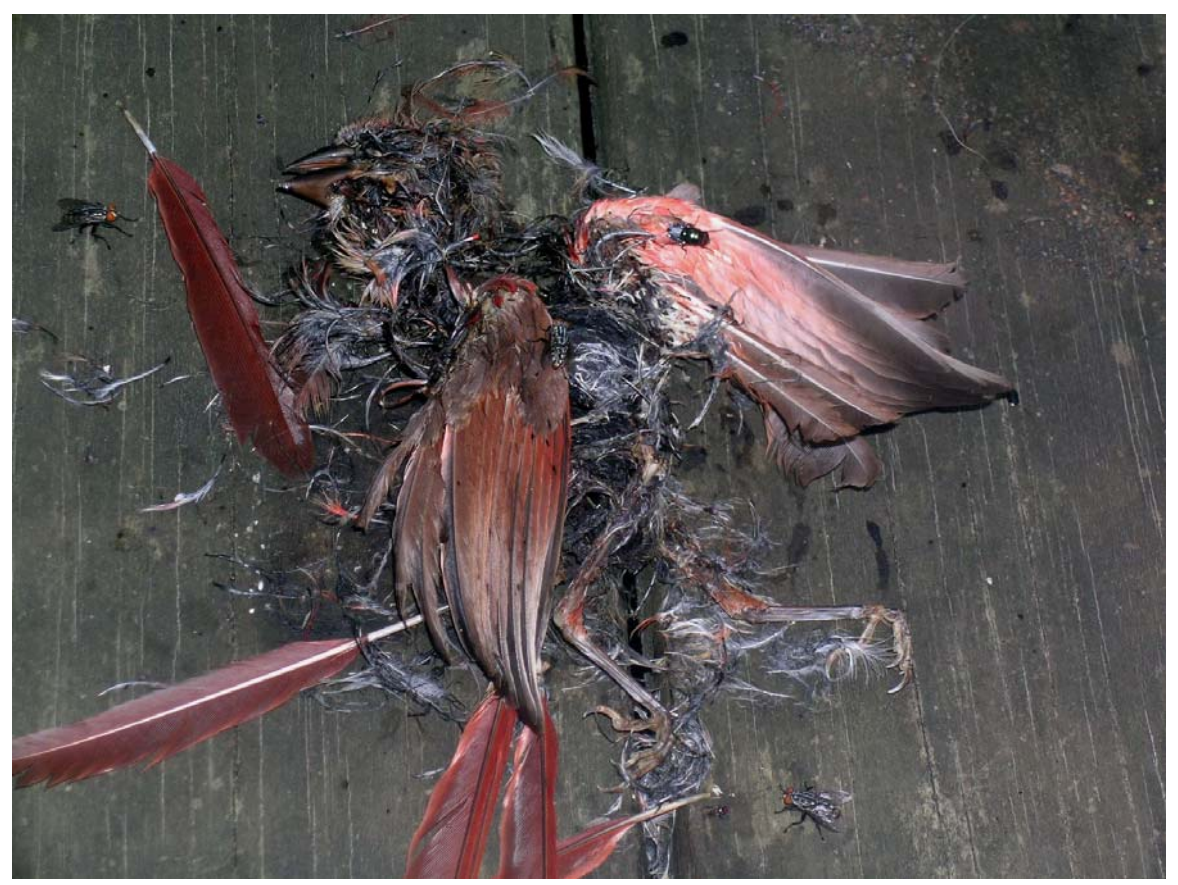
Flies around the corpse of a cardinal.

Also included at the end is an optional, related activity involving monitoring insect succession in a decaying chicken gizzard over several weeks. Review the activity to see if it can be useful or applicable to your program.