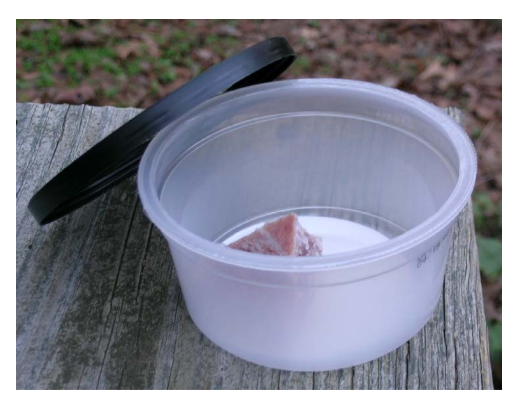
Container with "corpse" exposed to flies.