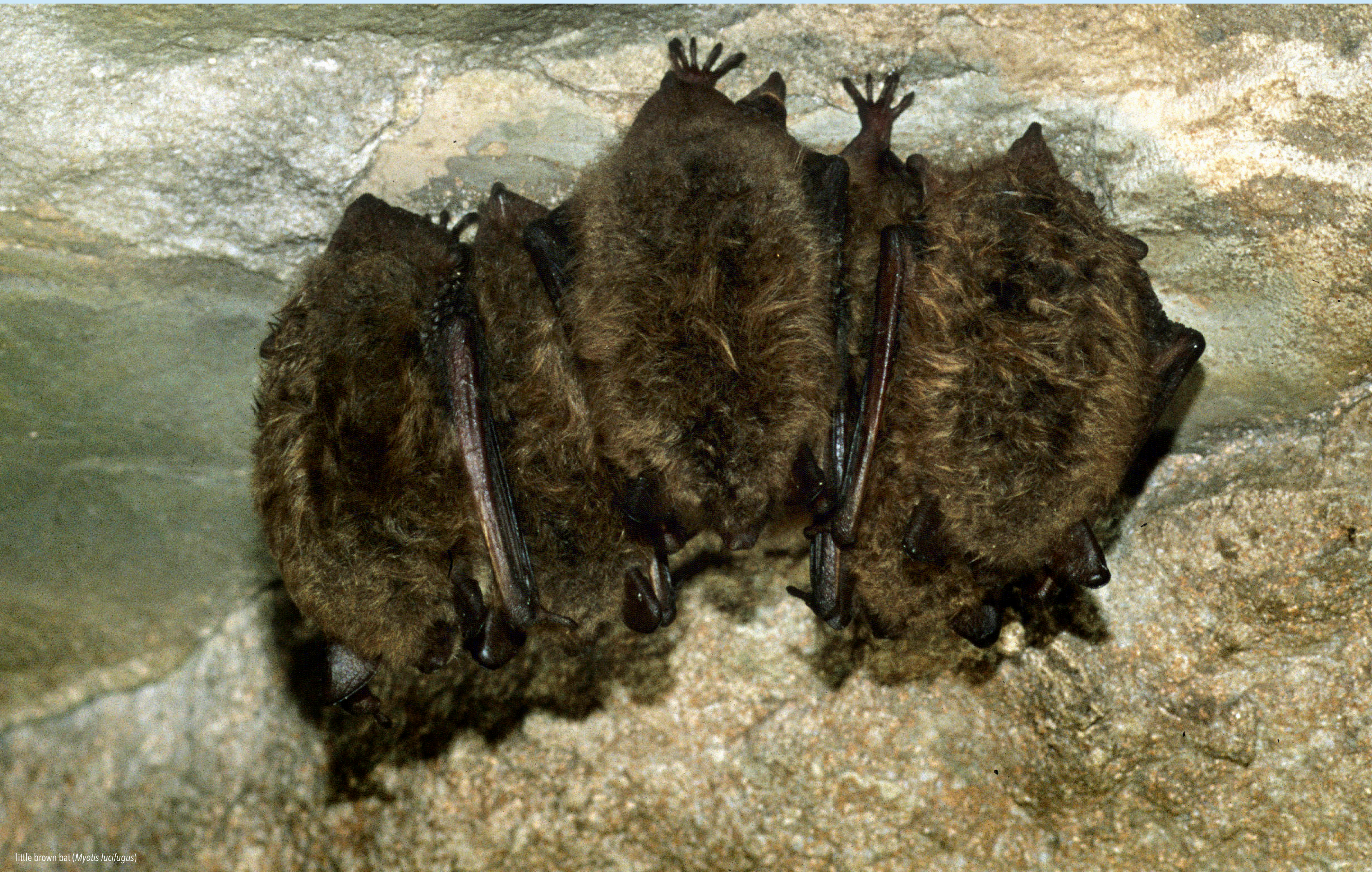
little brown bat ( Myotis lucifugus )