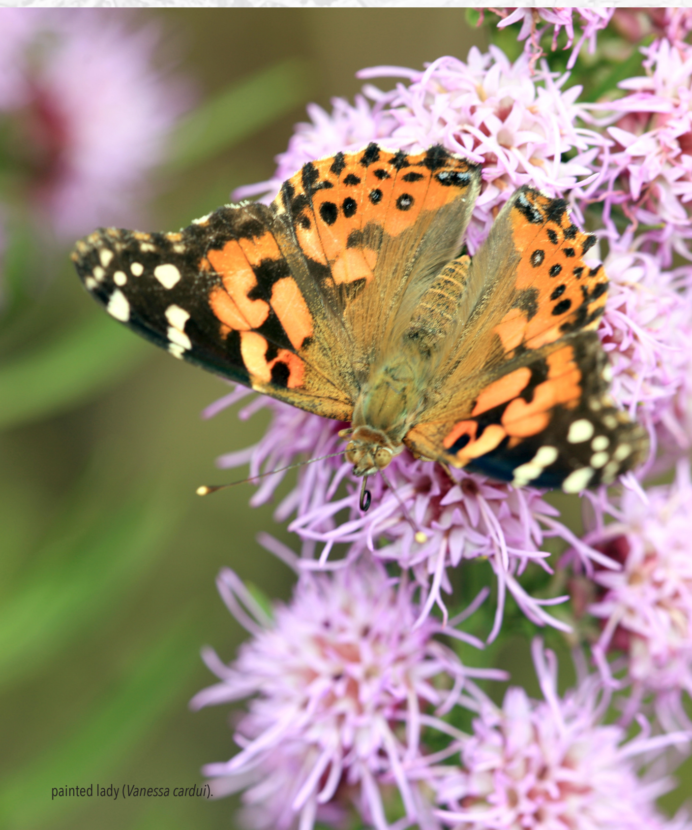
painted lady ( Vanessa cardui ).

The mourning cloak ( Nymphalis antiopa ) adult overwinters and may be seen on any day warm enough for flying. Most other butterfly species overwinter in the egg, larval, or pupal stages.