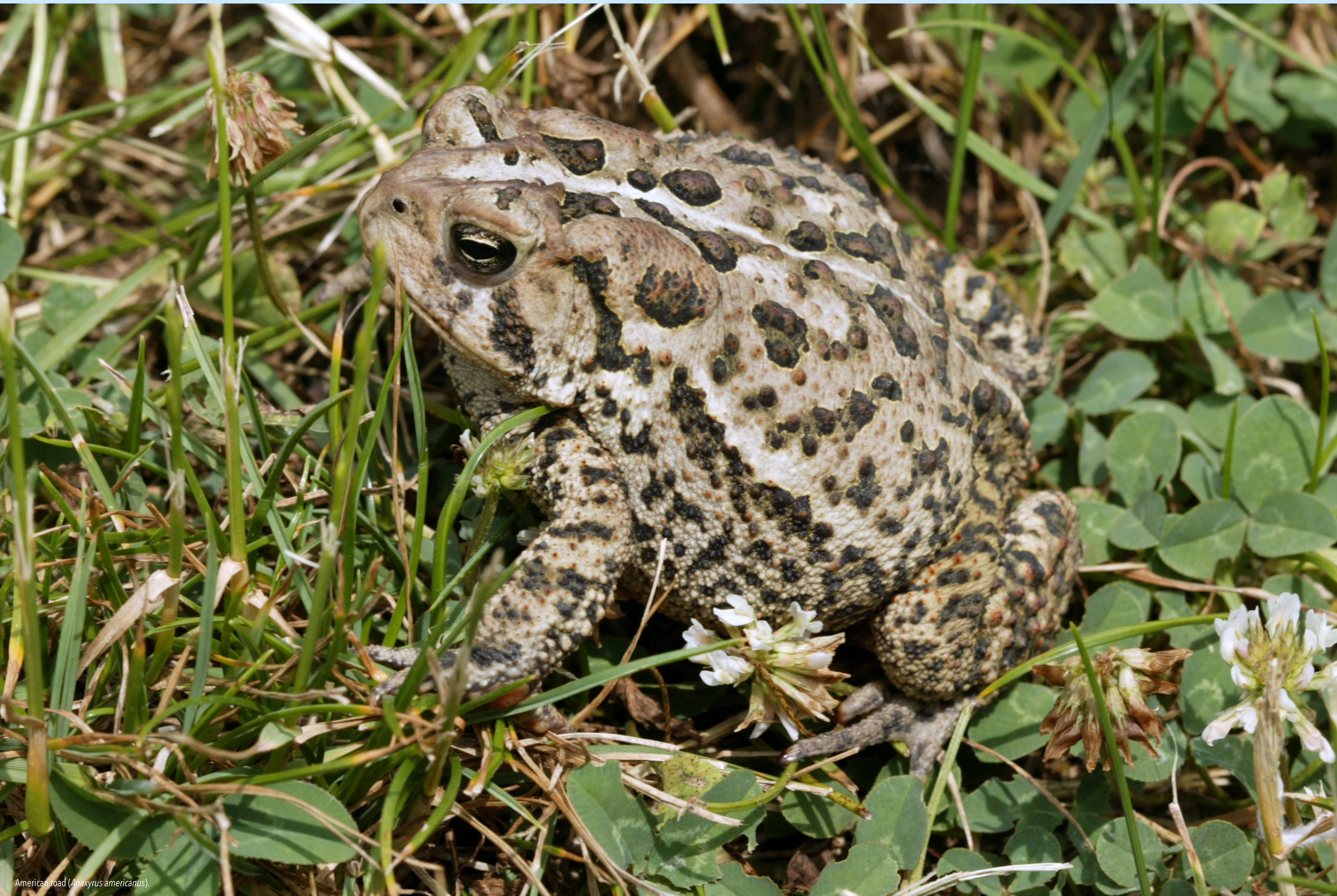
American toad ( Anaxyrus americanus ).