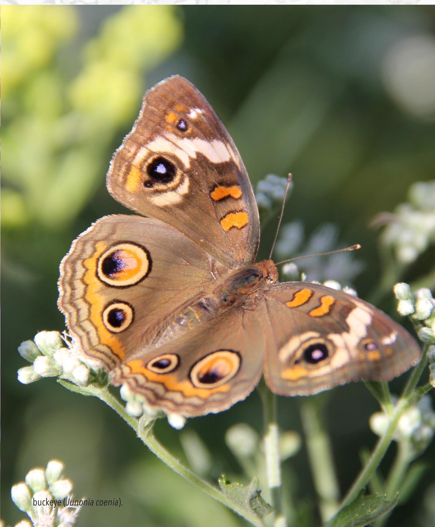
buckeye ( Junonia coenia ).