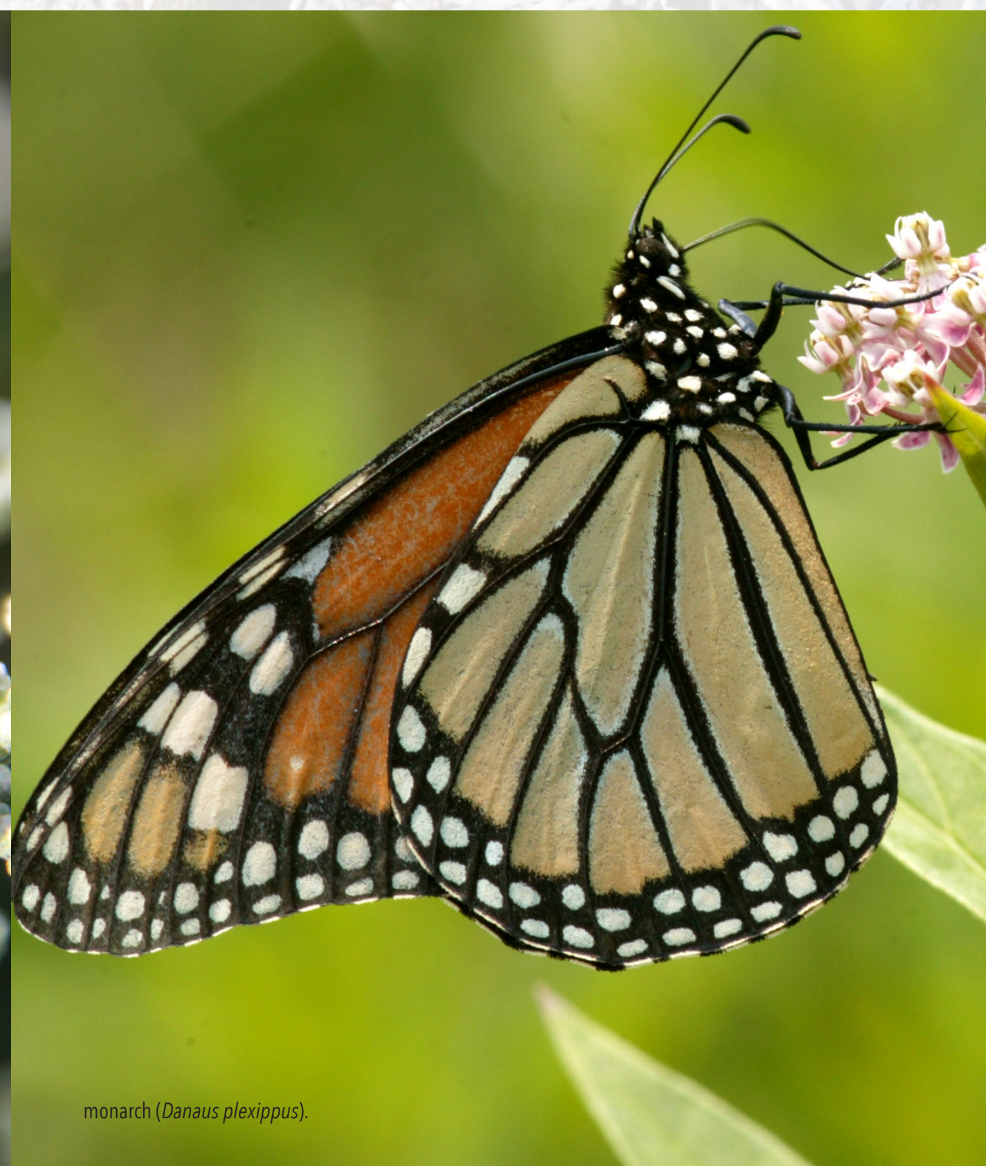
monarch ( Danaus plexippus ).

A few Illinois butterfly species migrate out of the state each fall. The returning butterflies are not the same individuals that left. New generations recolonize Illinois each spring.