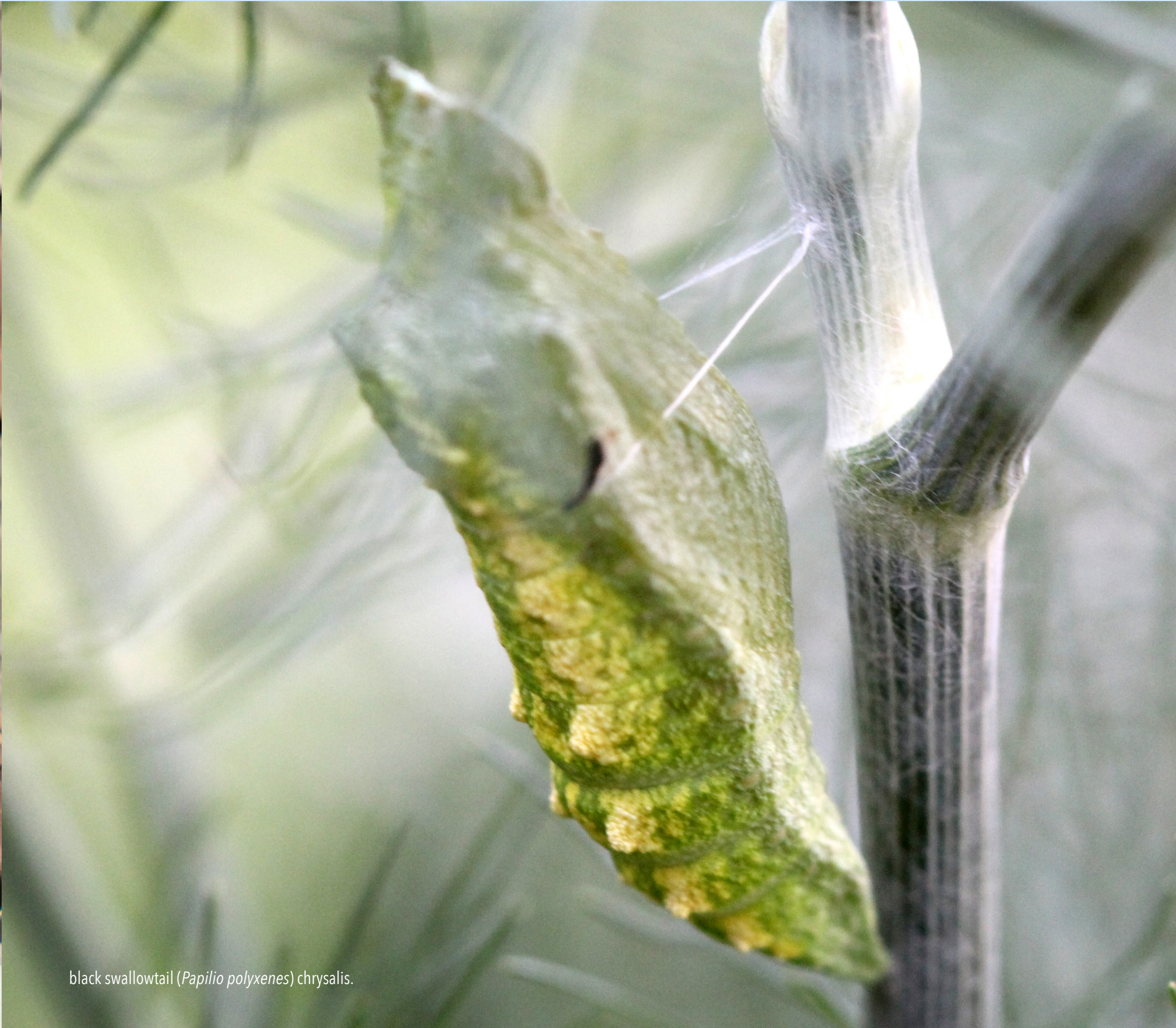
black swallowtail ( Papilio polyxenes ) chrysalis.