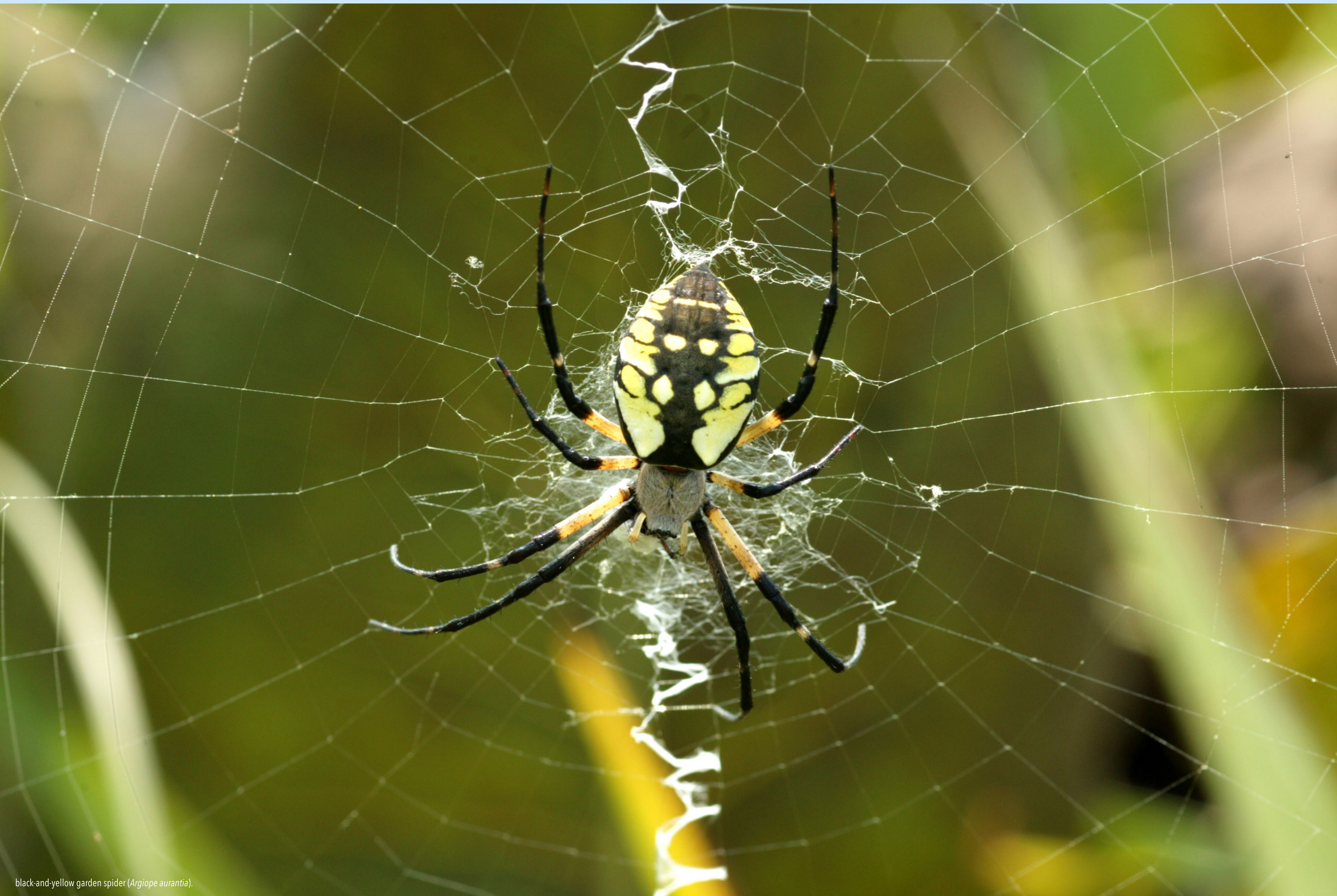
black-and-yellow garden spider ( Argiope aurantia ).