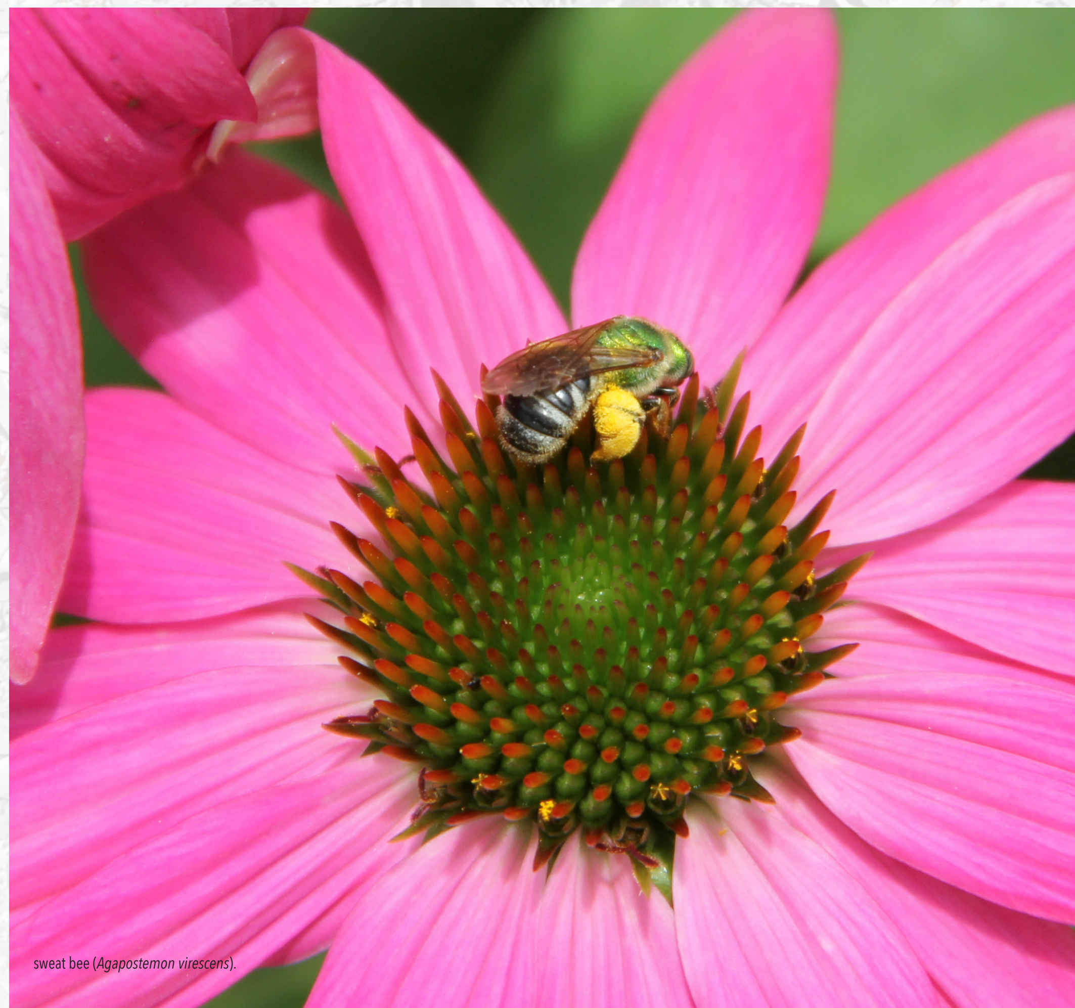
sweat bee ( Agapostemon virescens ).

Other native bee species will generally overwinter in the pupal or adult stage. This will also typically occur underground. Native bees will begin to appear in late spring and early summer.