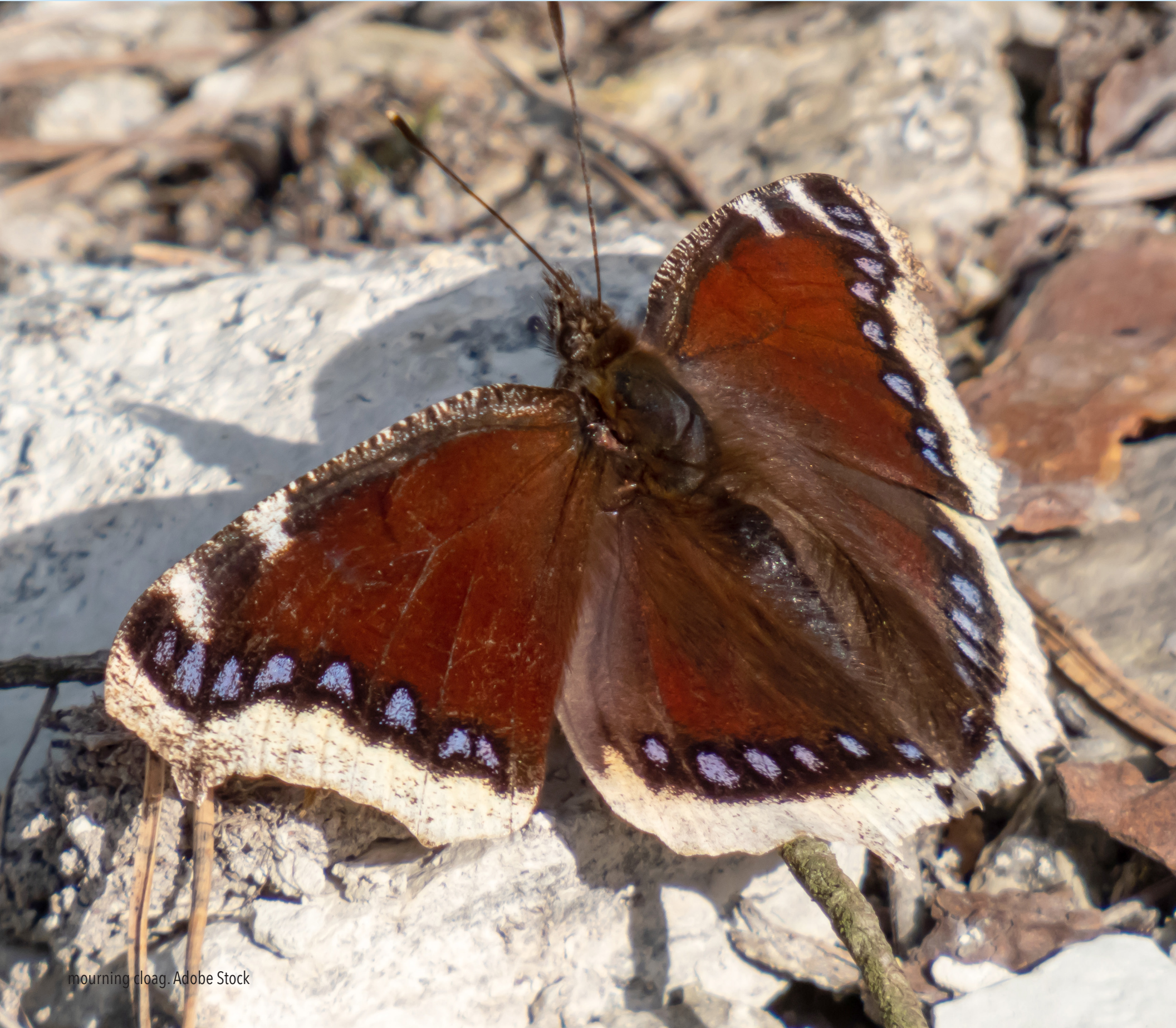
mourning cloak