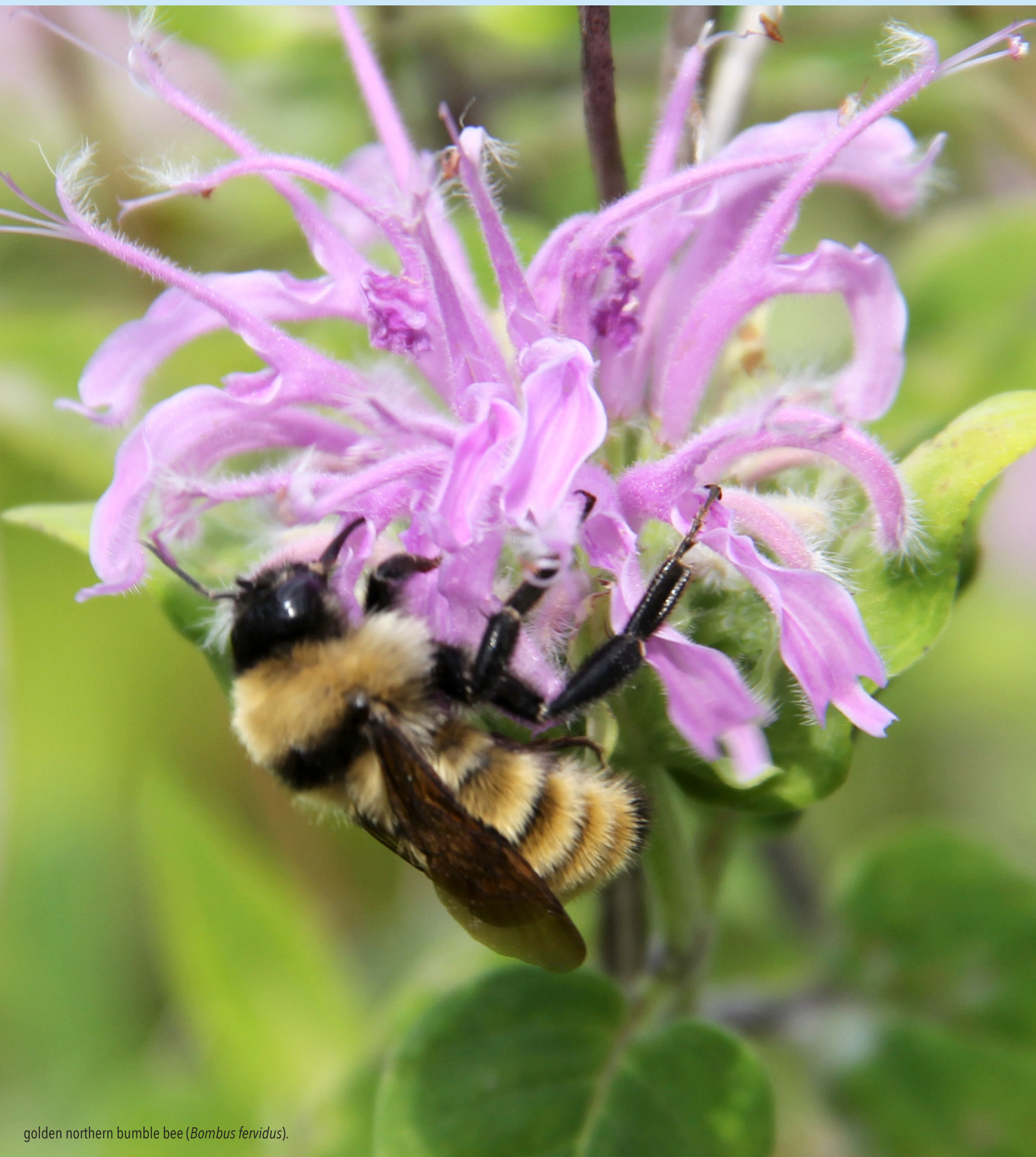
golden northern bumble bee ( Bombus fervidus ).