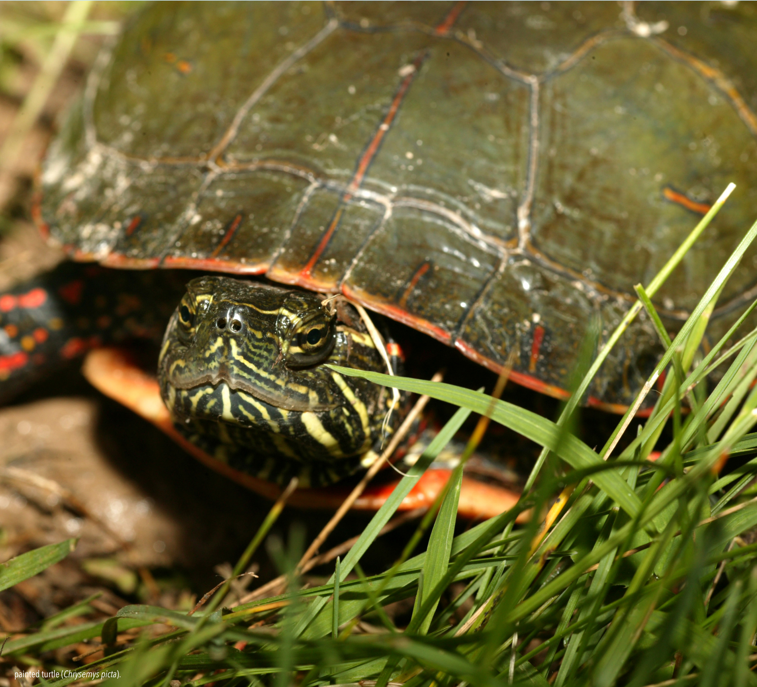
painted turtle ( Chrysemys picta ).