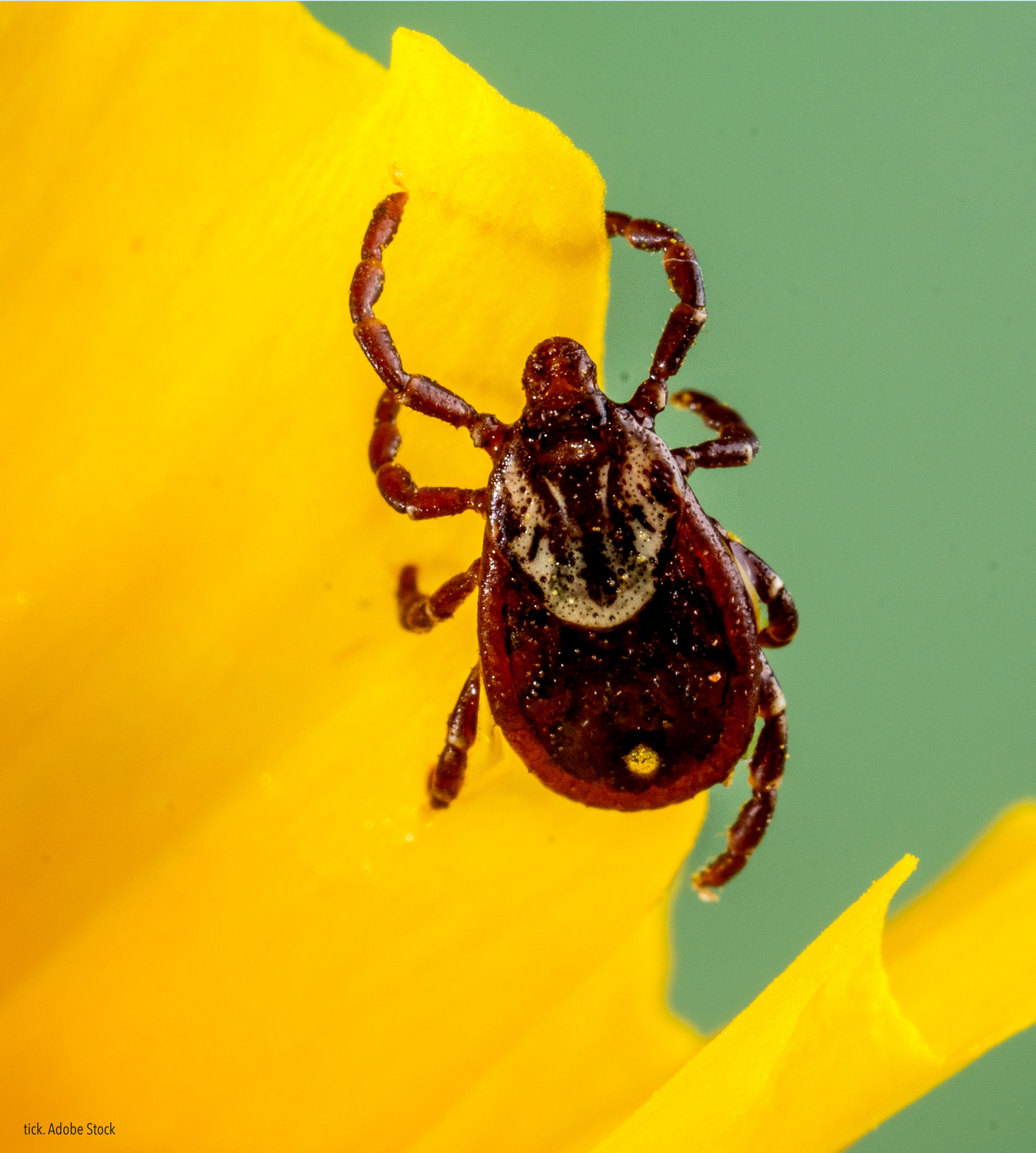
tick. Adobe Stock