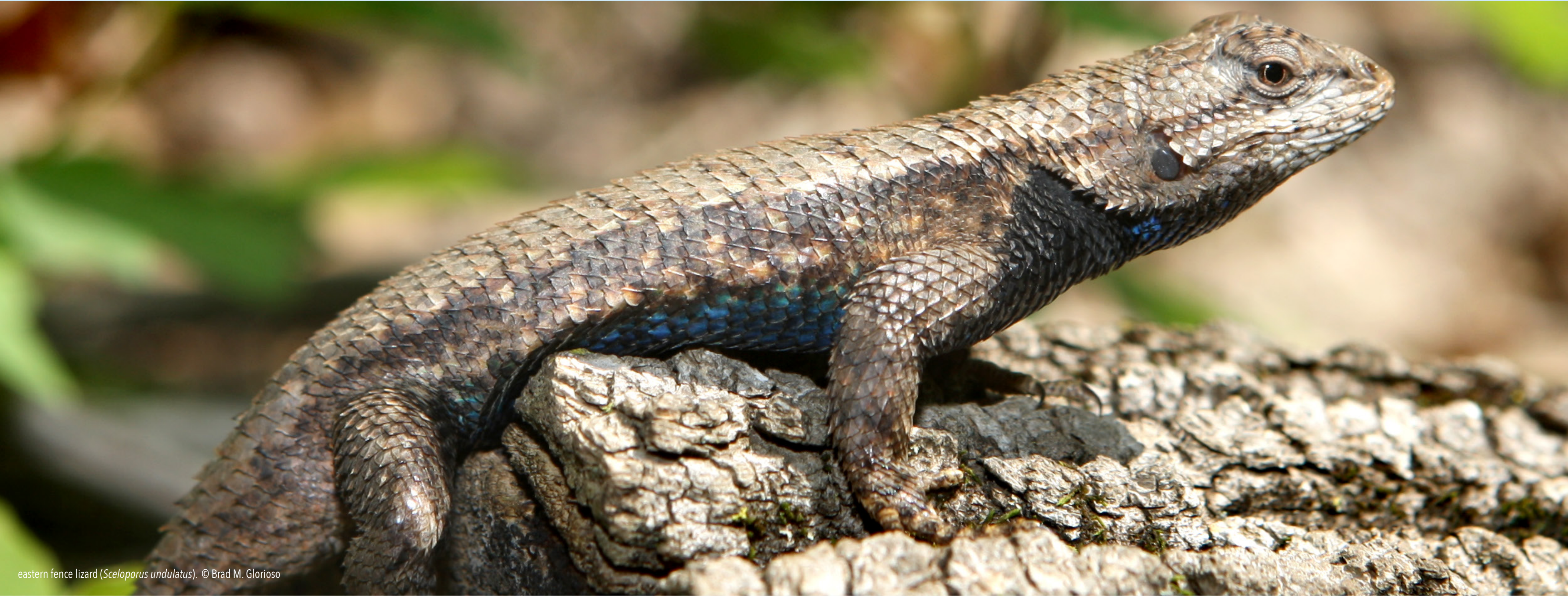
eastern fence lizard ( Sceloporus undulatus ).