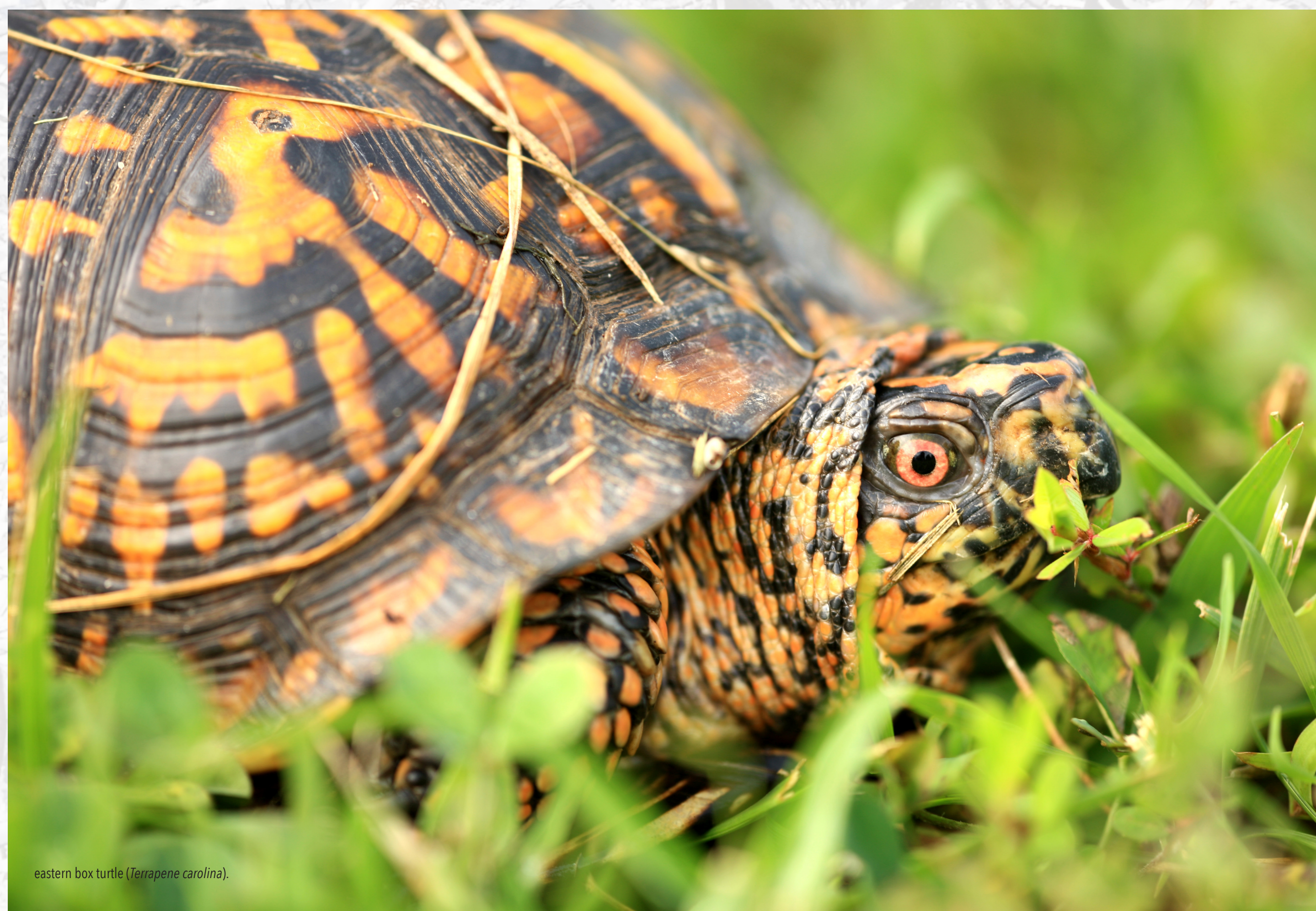
eastern box turtle ( Terrapene carolina ).

Terrestrial turtles generally burrow, find a hole in the ground, maybe a fallen tree trunk, etc. and brumate.