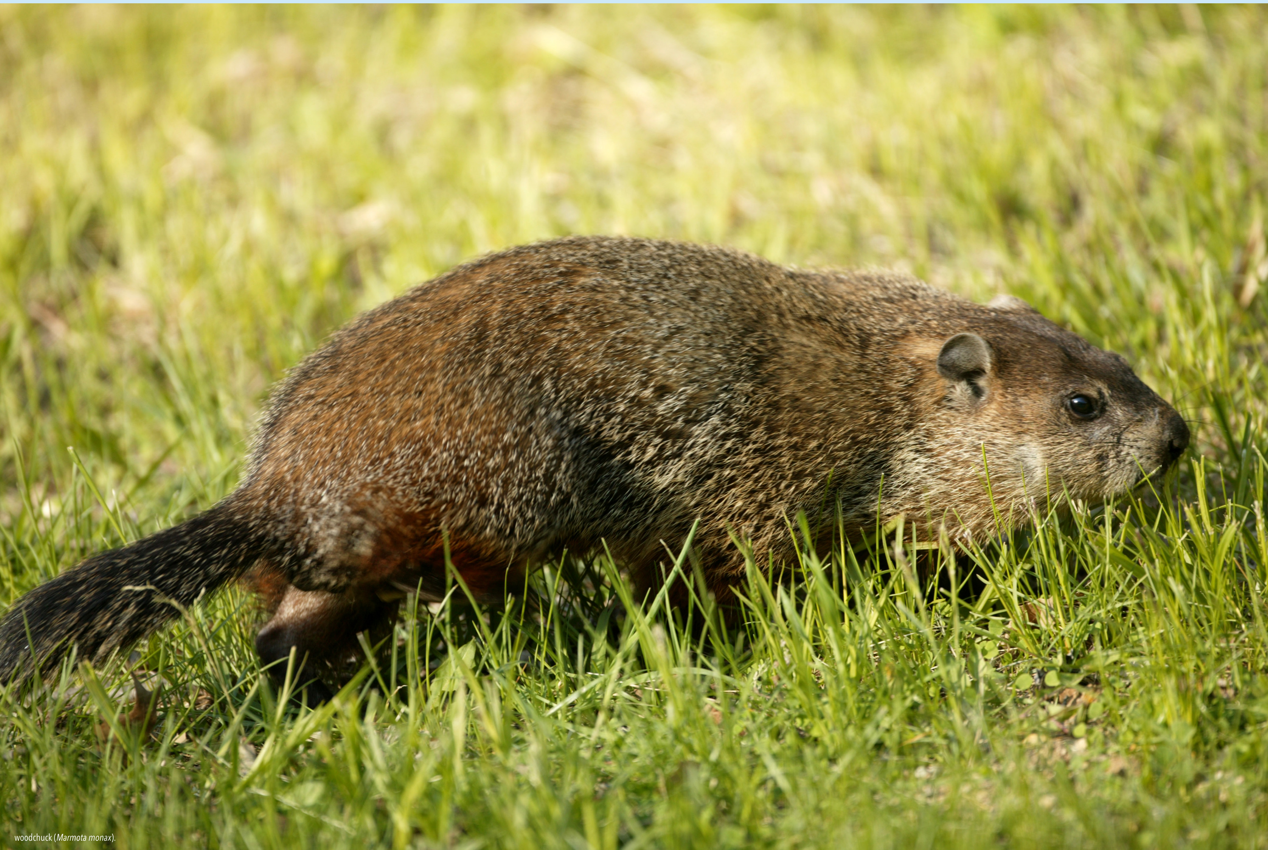
woodchuck ( Marmota monax )