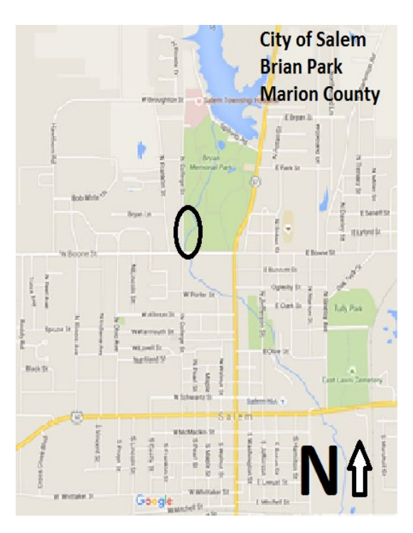
Example: Location Map (Village)