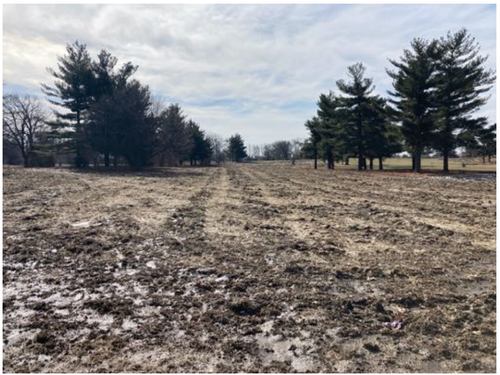
Another picture of the restoration site after spraying, disking and planting.