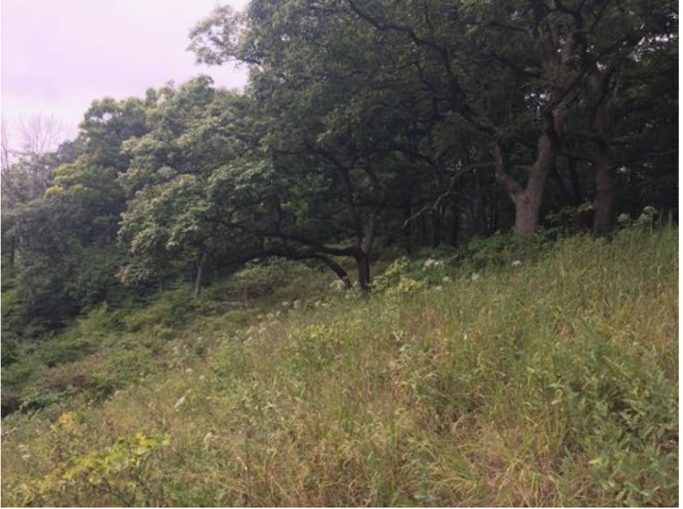
Existing Hill Prairie, prior to woodland restoration. The adjacent woodland was opened up by removing exotic/invasive shrub species. The goal is to make this native habitat more accessible to RPBB that use the nearby prairie plantings.