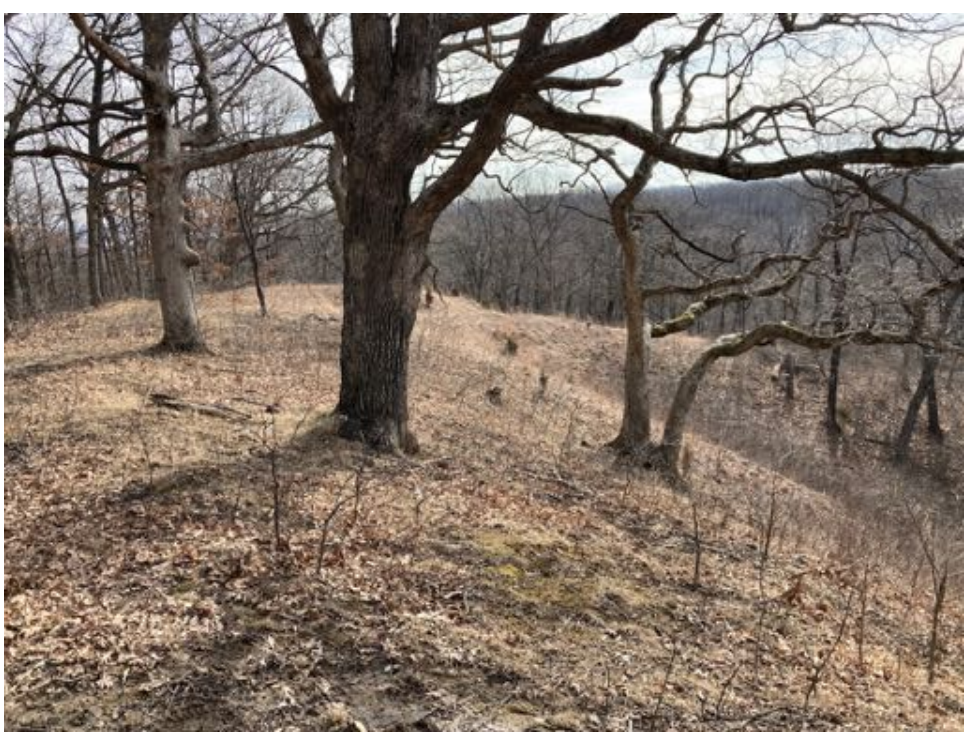
Hill Prairie after timber stand improvement.