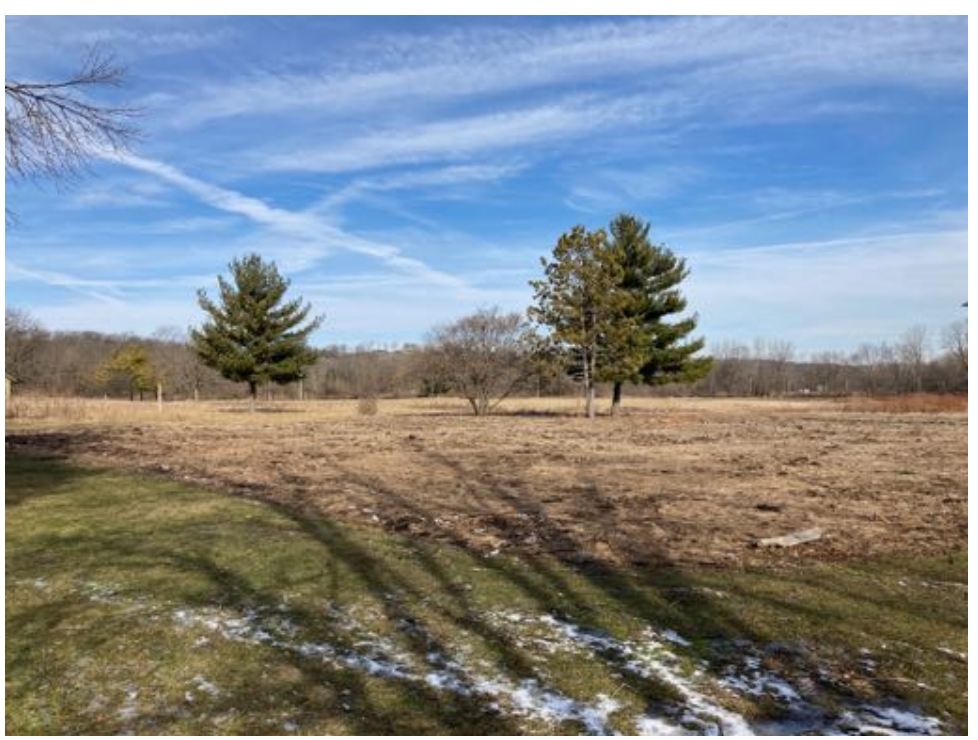
Part of the portion of Detweiller Riverside above the flood zone. This is after chemical burndown of cool season grasses, disking, and planting.