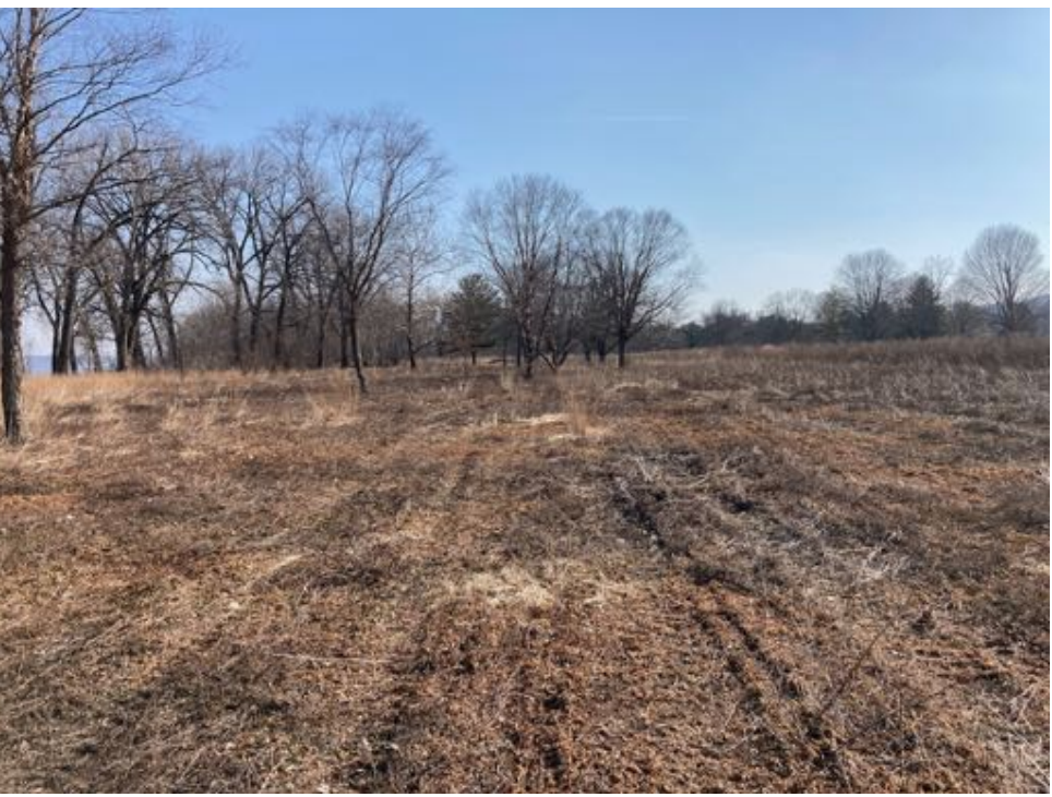
Photo of same flood zone in winter 2021 after removal and treatment of invasives, rough disking and over-seeding.