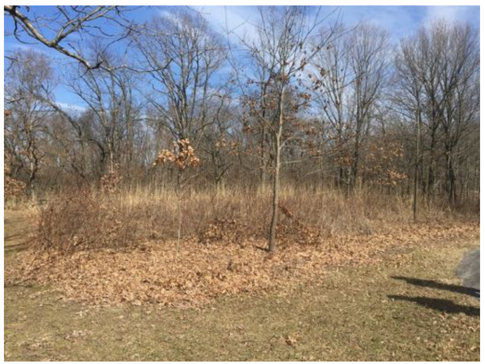
Existing prairie planting where Rusty Patched Bumble Bee is known to be present.