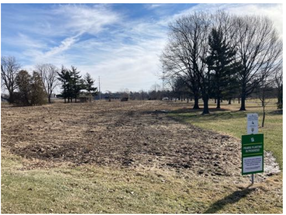
Another picture of the restoration site after spraying, disking and planting.