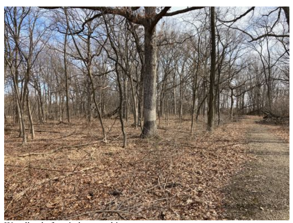
Woodland after timber stand improvement.