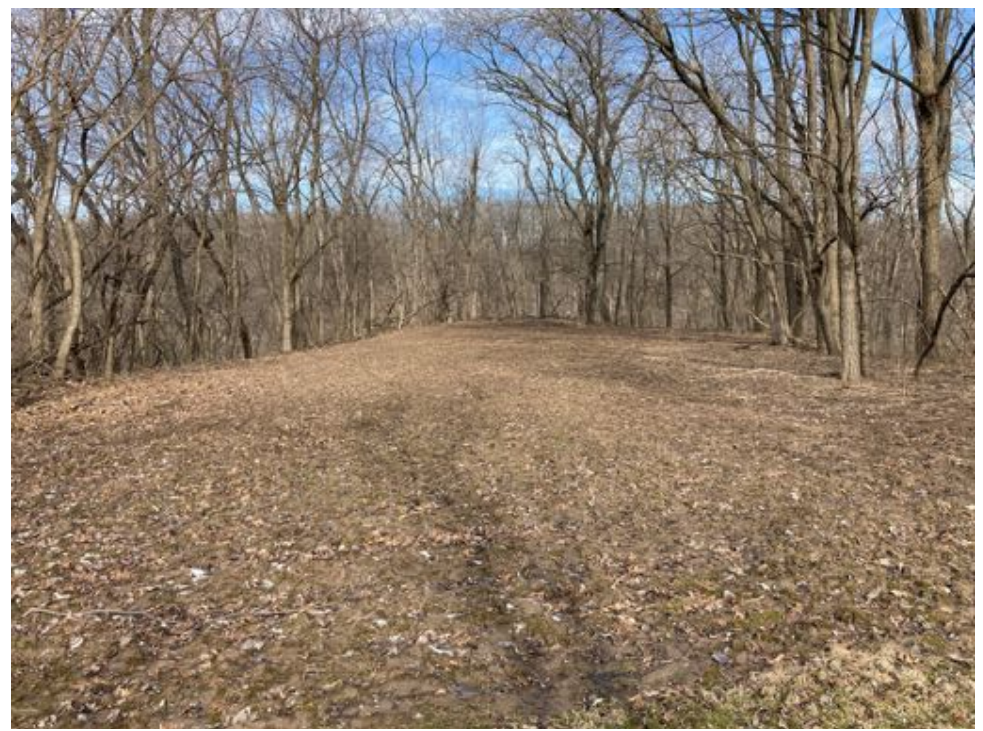
Additional Prairie Planting area after invasive removal, disking and planting.