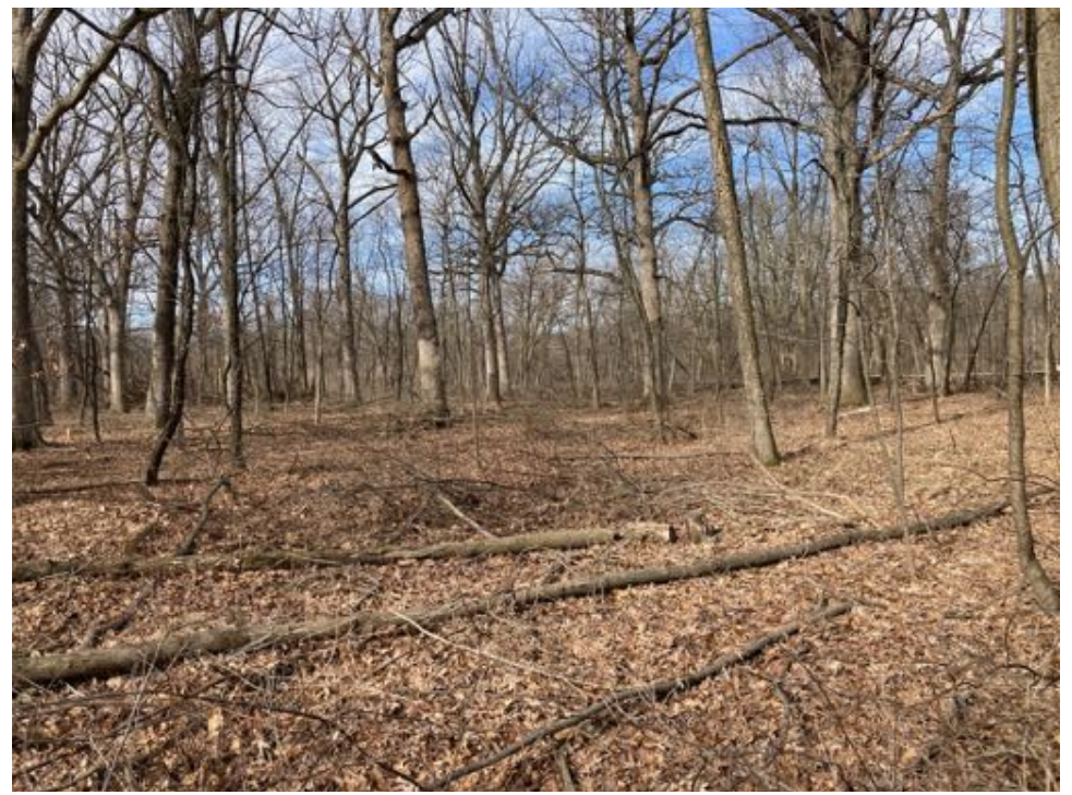
Woodland after timber stand improvement.