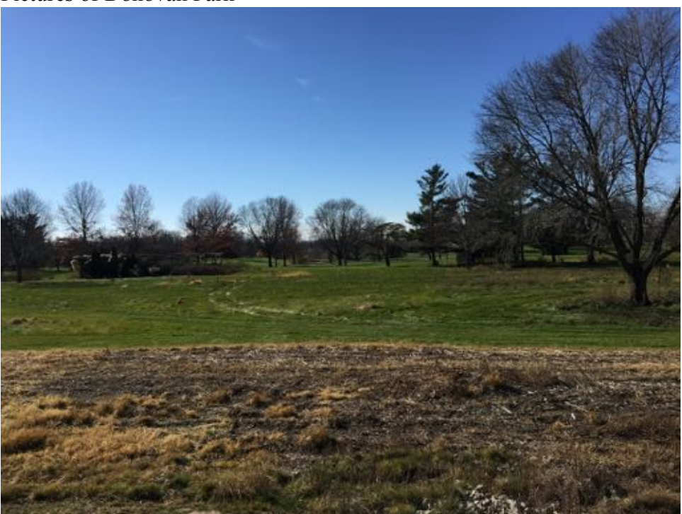
Donovan Park Spring 2019 before restoration. Cool season grasses were sprayed, ground was disked, and then site was seeded with PF Basic Pollinator and Pollinator Plus Mix.