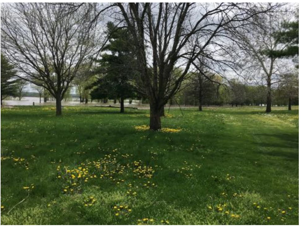
Photo from spring 2019 showing flood zone (15 acres). This is the area where we did invasive species removal, disking, and conservation over-seeding with a broadcast seeder.