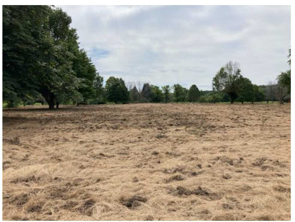
Part of the portion of Detweiller Riverside above the flood zone. This is after chemical burndown of cool season grasses, disking, and planting.