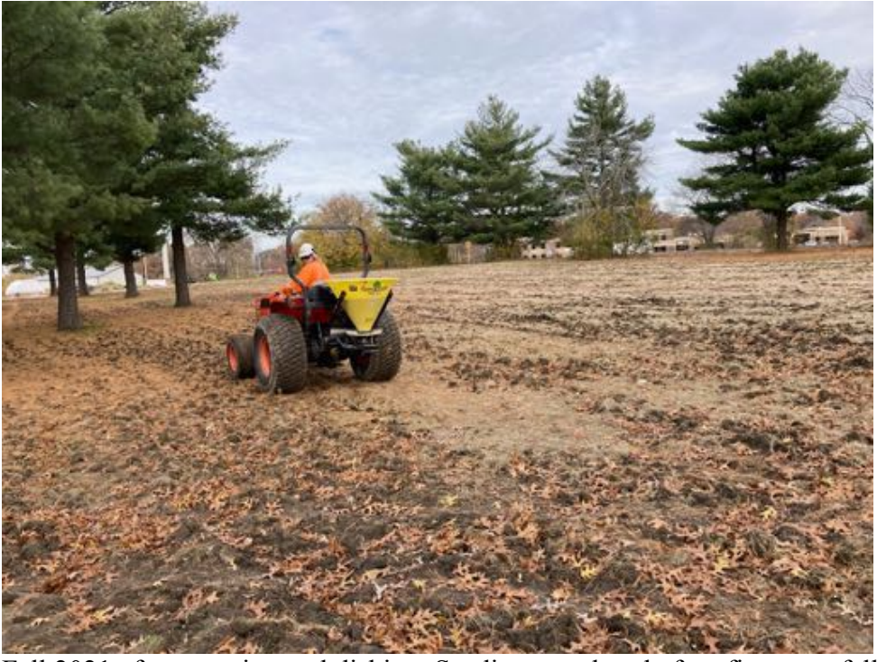
Fall 2021 after spraying and disking. Seeding two days before first snowfall.