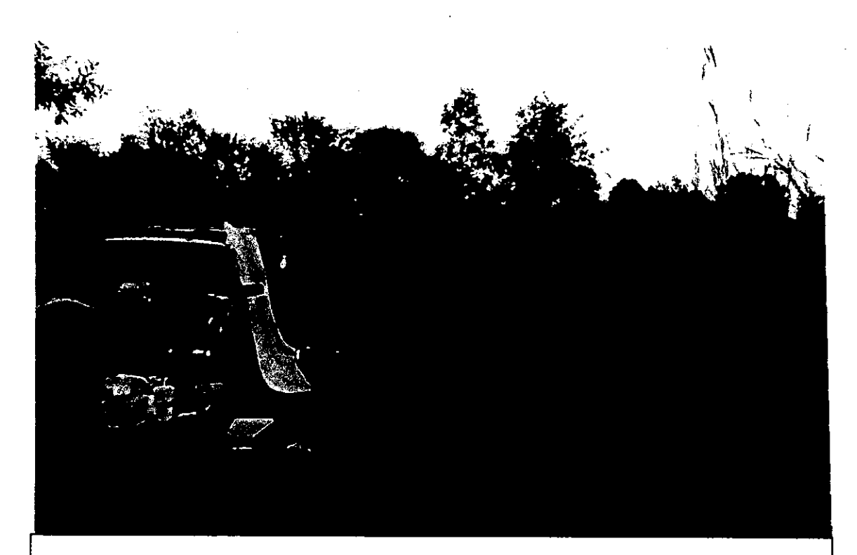
Figure 1Equipment for nocturnal survey at "Remote Prairie", Siloam SpringsState Park, Adams County, Illinois.