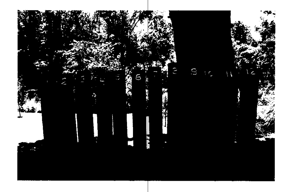
Attachment 4. Numbered wooden trail markers.