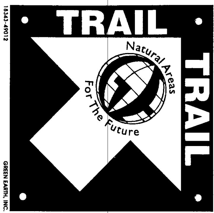
P.O. BOX 441 CARBONDALE, IL 62903