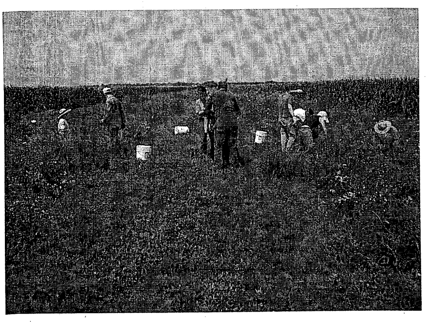
FIGURE 4: WORKDAY AT SHORTLINE PRAIRIE CONDUCTED BY INTERNS