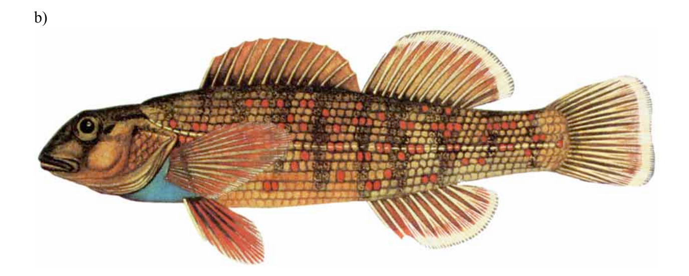
Figure 2. a) Northern riffleshell Epioblasma rangiana (Lea) and b) bluebreast darter Etheostoma camurum (Cope). Northern riffleshell photo by Kevin Cummings and bluebreast darters drawing by Rob Criswell.