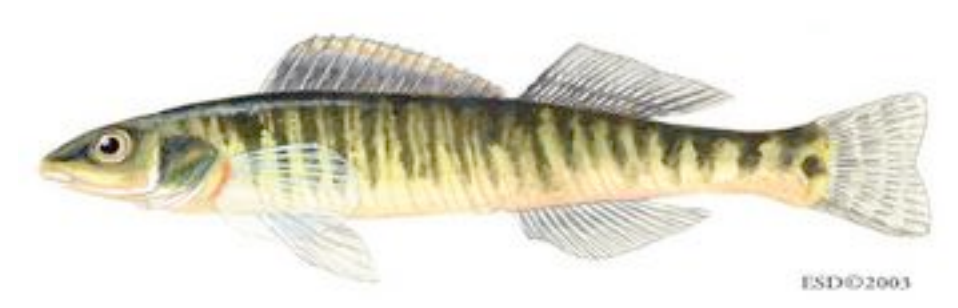
Figure 2. – a) Snuffbox Epioblasma triquetra (Rafinesque) and b) logperch Percina caprodes (Rafinesque). Snuffbox photo by Kevin Cummings and logperch drawing by Emily Demestra.