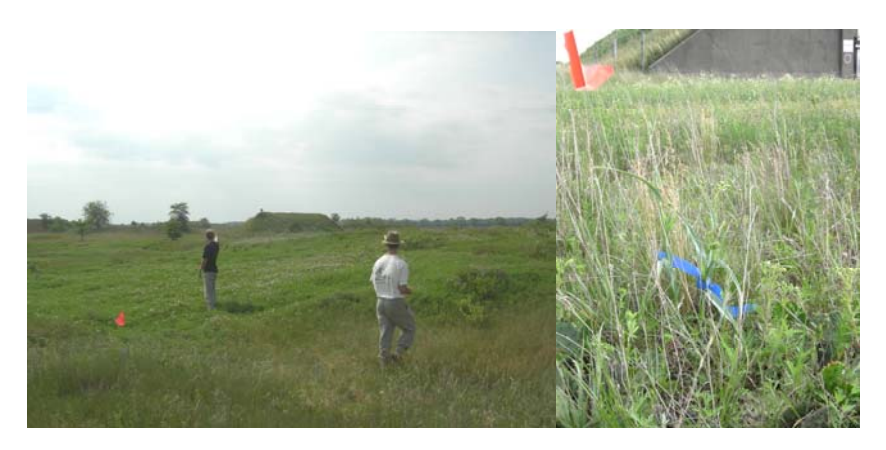
Figure 1. Field assistants (left photo) searching for Tradescantia ohiensis plants with a single inflorescence (right photo) inside and outside a crown vetch patch at the Lost Mound Unit of the Upper Mississippi River National Wildlife and Fish Refuge.

Four Tradescantia ohiensis plants were tagged inside and outside the plots on June 7 to determine flower visitation for a total of 8 plants per crown vetch patch (4 inside and 4 outside; Figure 1). On June 17 and 18, 10-minute flower visitation observations were conducted per Tradescantia ohiensis plant. In the case of crown vetch, four 25 m<sup>2</sup> plots, two inside and two at the edge of the patch, were observed for ten minutes. Observations were conducted by the same four people simultaneously.