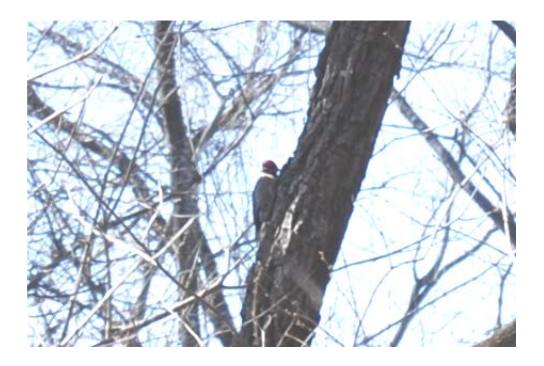
Figure 6. Yellow-bellied Sapsucker, Sphyrapicus varius , from Sweet William Woods located within the SIUE Nature Preserve.