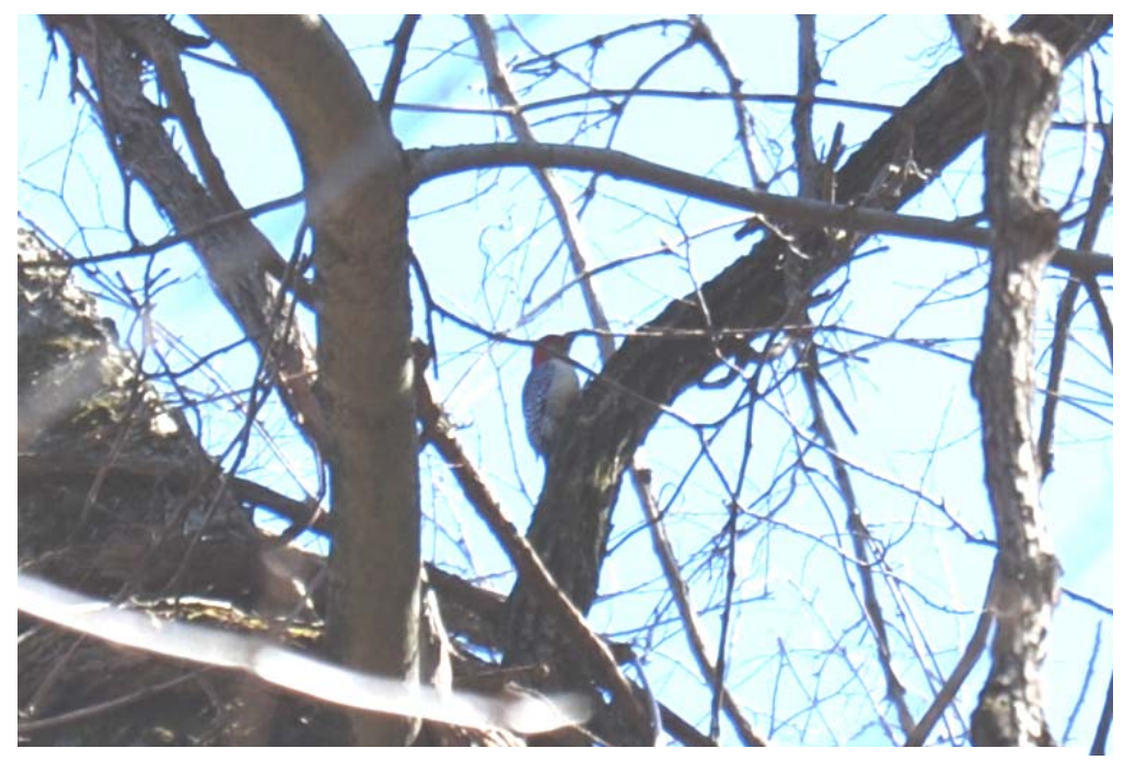
Figure 5. Red-bellied Woodpecker, Melanerpes carolinus , from Bluebell Woods on campus of Southern Illinois University Edwardsville.