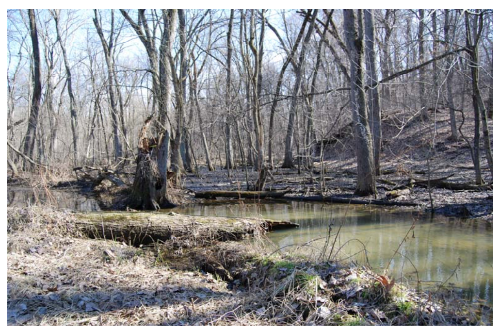
Figure 7. Bottomland Forest in Bohm Woods State Nature Preserve. This area of the forest provides high-quality habitat for neotropical migrants such as the state threatened Cerulean Warbler, Dendroica cerulea , which was identified in this area during the study.