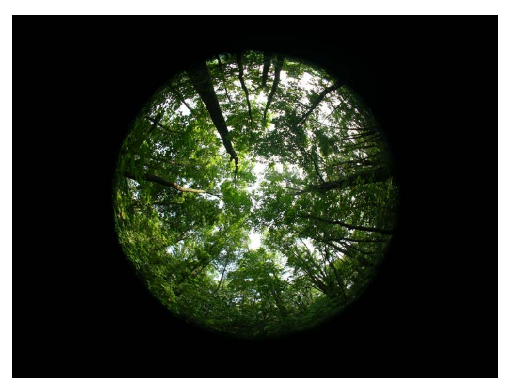
Figure 2. Canopy photo of Bohm Woods State Nature Preserve.