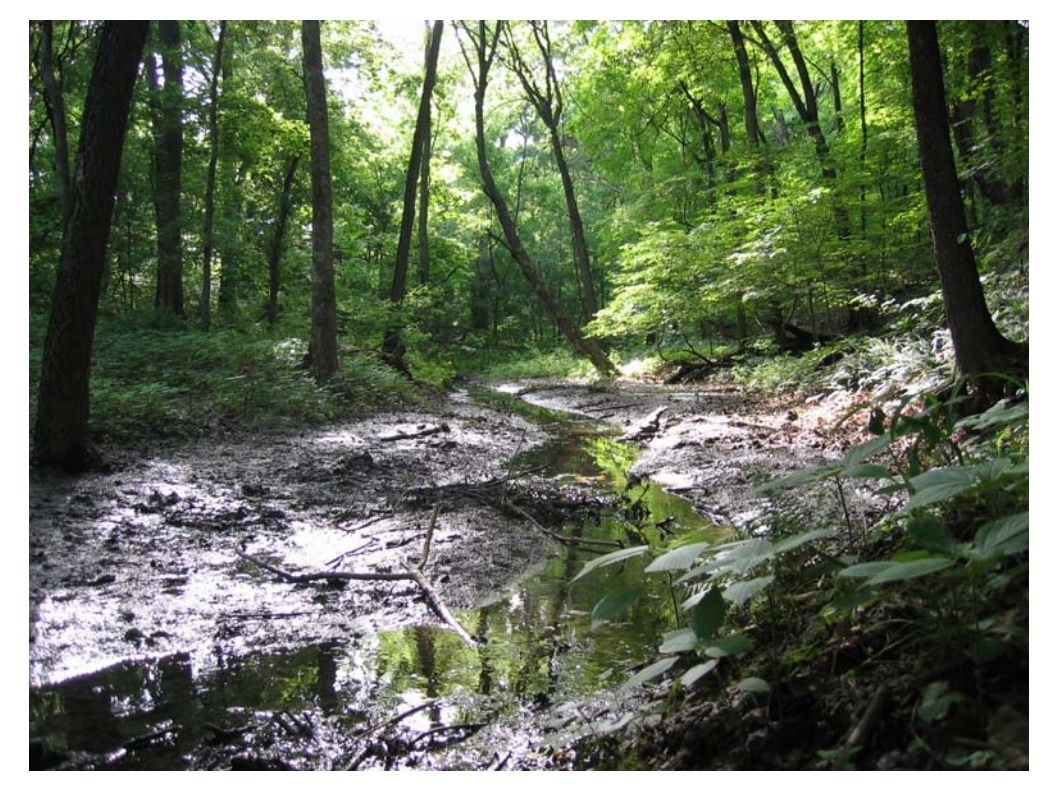
Figure 3. Ravine habitat in Bluebell Woods on the campus of Southern Illinois University Edwardsville.