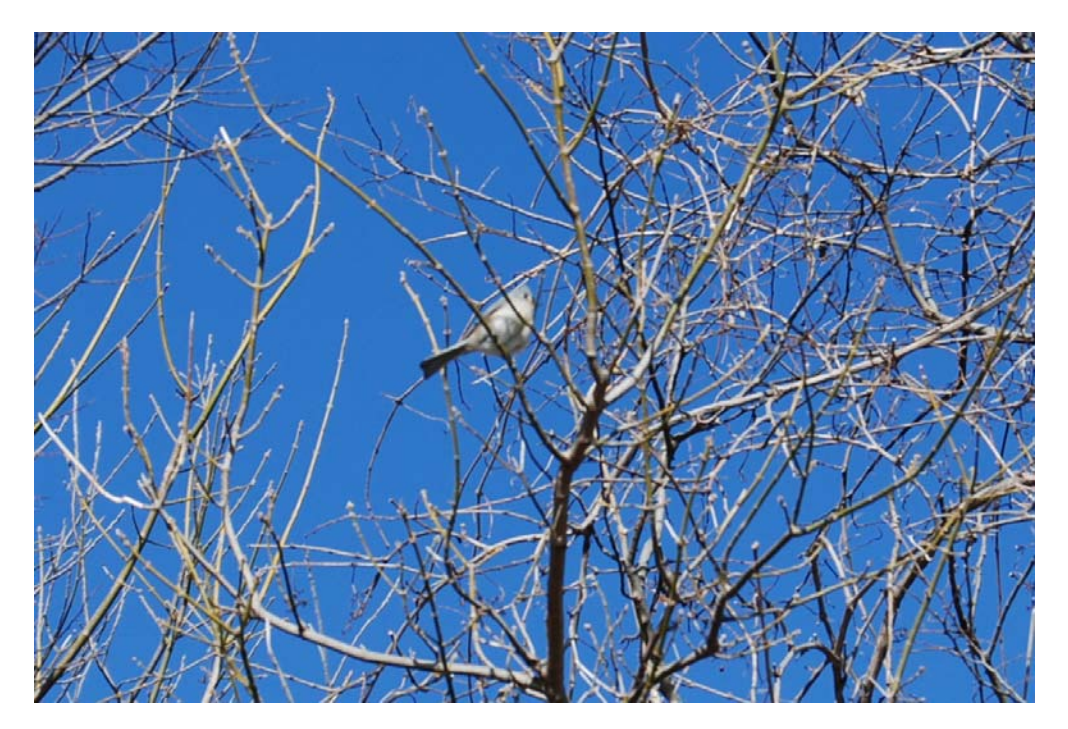
Figure 4. Tufted Titmouse, Baeolophus bicolor , from Bohm Woods State Nature Preserve.