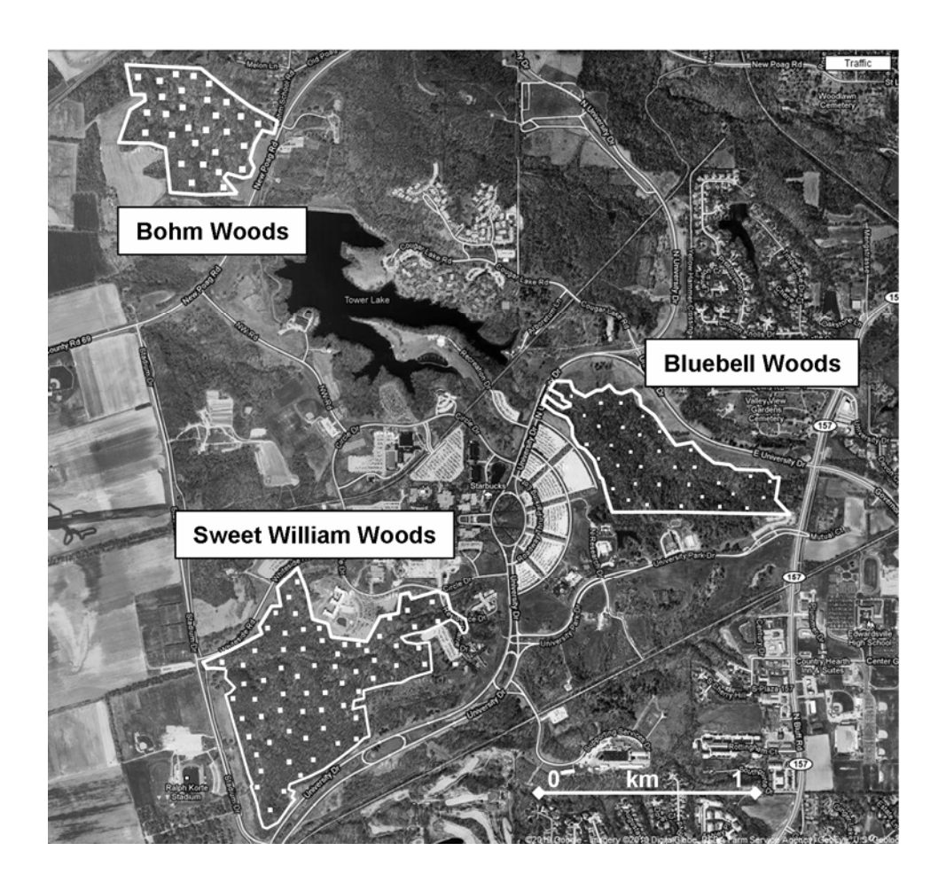
Fig. 1. Aerial photo of 3 forest patches in Madison County, IL where avian point count surveys were conducted. White lines indicate boundaries of sampled areas and dots indicate locations of sampling plots (N=129).