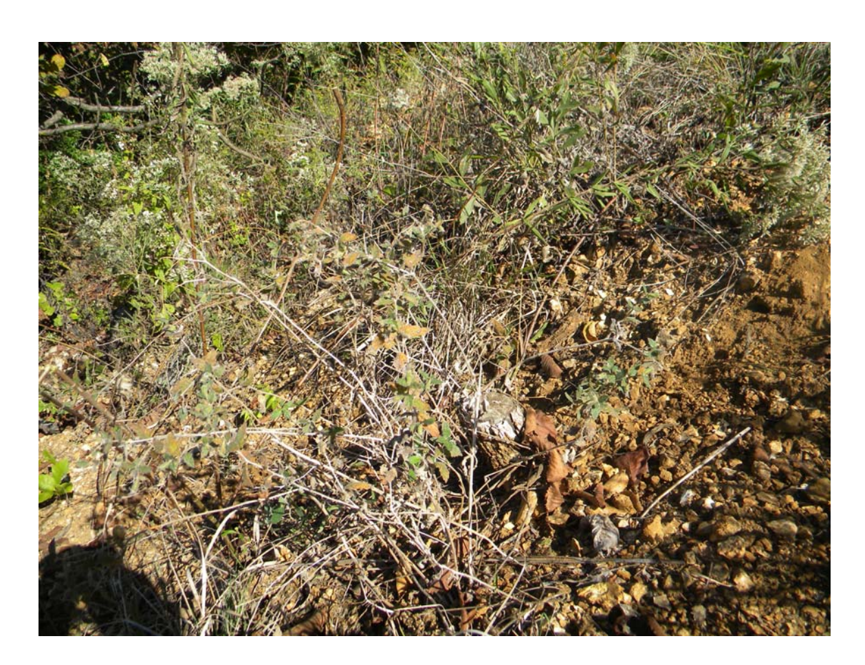
Mentzelia oligosperma (stickleaf) growing in gravel and loess on a hill prairie slope.