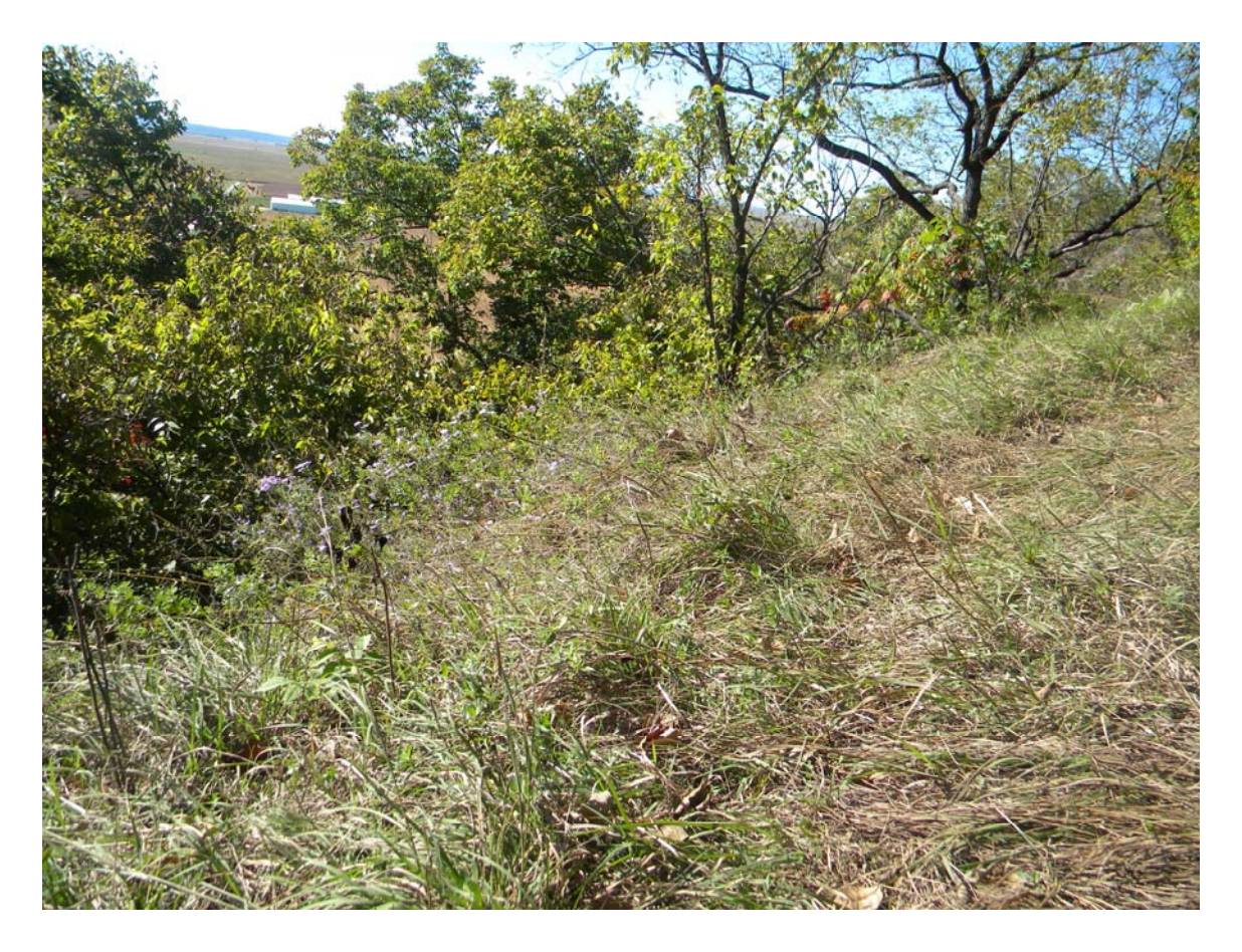
Figure 4. Woody vegetation that has completely overtopped the cliff face and the habitat of Mentzelia oligosperma , creating dense afternoon shade and altering the microclimate. Woody vegetation like this deflects the hot, dry summer winds upward, making the rock ledge habitat less xeric.