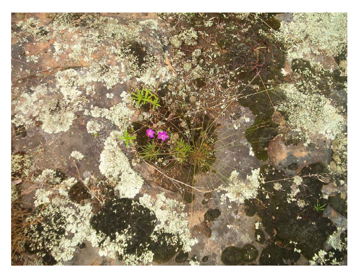
Figure 6. A Phemeranthus plant in bloom in the afternoon at Horse Creek in Monroe County. The plant is growing in a small basin with sedges and Diodia teres .