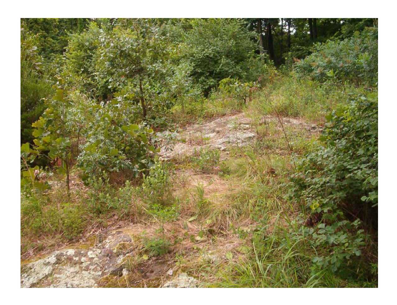
Figure 7. The west end of the Aux Vases sandstone outcrop at Horse Creek in Monroe County. The grasses are primarily broomsedge ( Andropogon virginicus ) and the small trees are post oaks ( Quercus stellata ) and the shrub aromatic sumac ( Rhus aromatica ). This vegetation threatens to make the habitat less suitable for Phemeranthus .