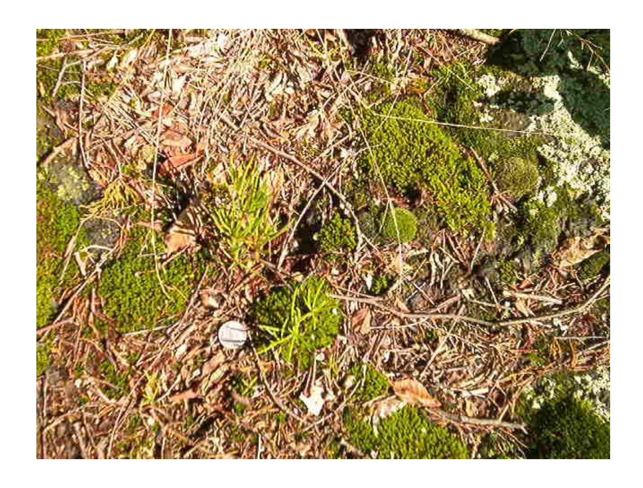
Figure 2. Phemeranthus calycinus plants at Castle Rock near Leanderville in Monroe County, Illinois. The quarter gives a scale to judge the size of the succulent Phemeranthus plants immediately to the right and top of the quarter. These plants did not bloom this year. Note the abundant litter from eastern red cedar ( Juniperus virginiana ), and the Phemeranthus plants growing in clumps of moss.