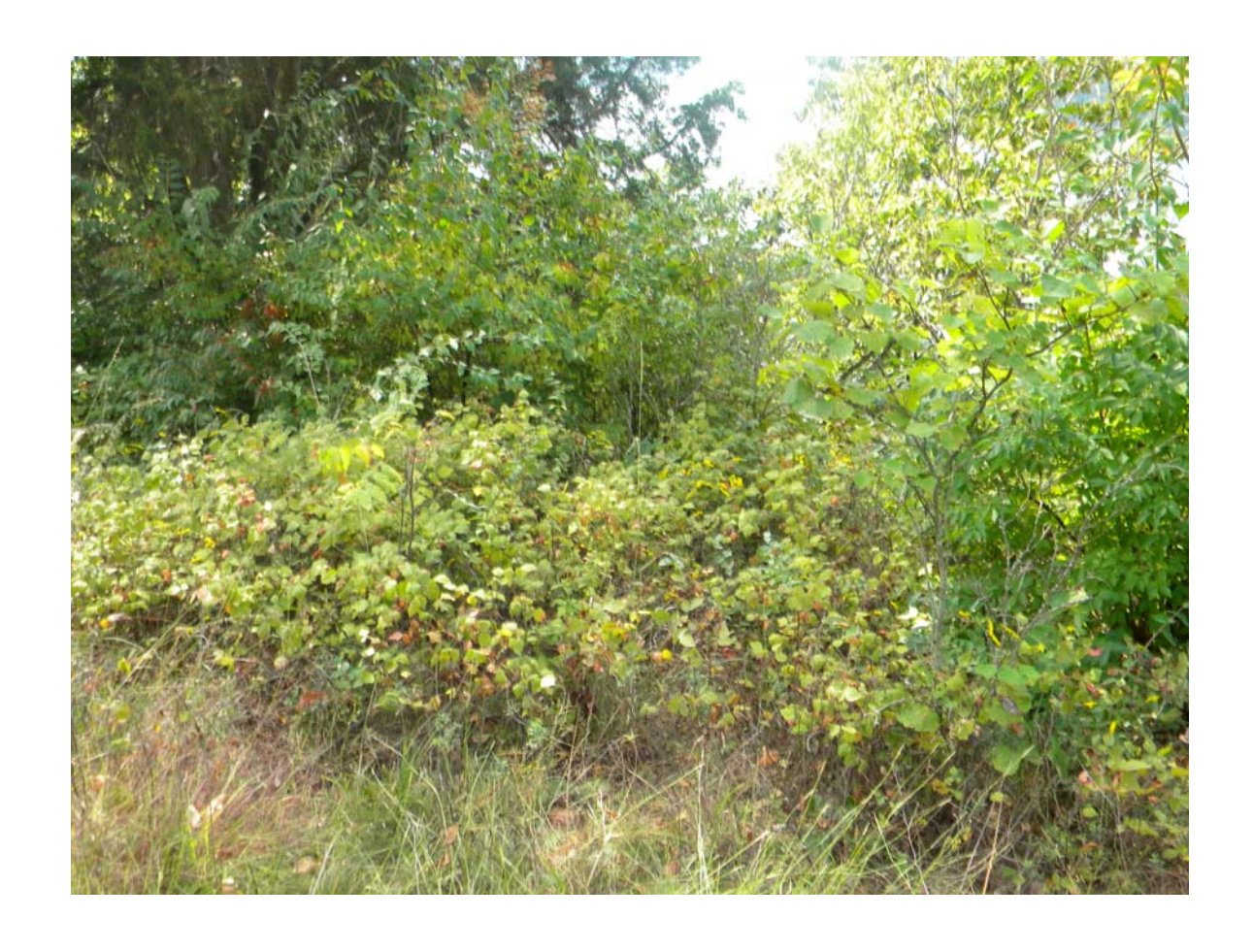
Figure 5. Woody vegetation that is advancing downhill toward the cliff face, creating morning shade and altering the microclimate of the cliff face.