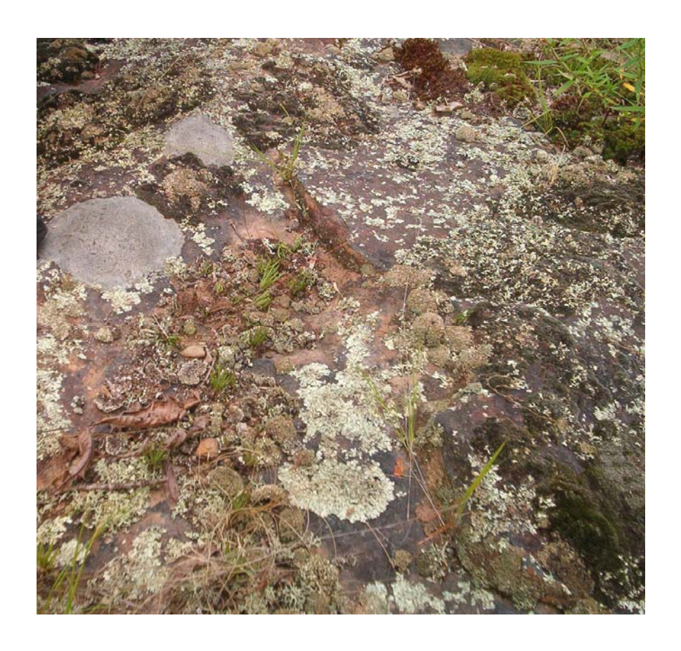
Figure 5. A "basin" at the Phemeranthus site along Horse Creek, Monroe County. These basins retain water for short periods following rains, enabling the mosses, lichens, and rock pinks to adsorb moisture. The mosses and lichens appear to provide ideal germination sites for Phemeranthus seeds. The mosses also serve as ideal growing sites for mature plants.