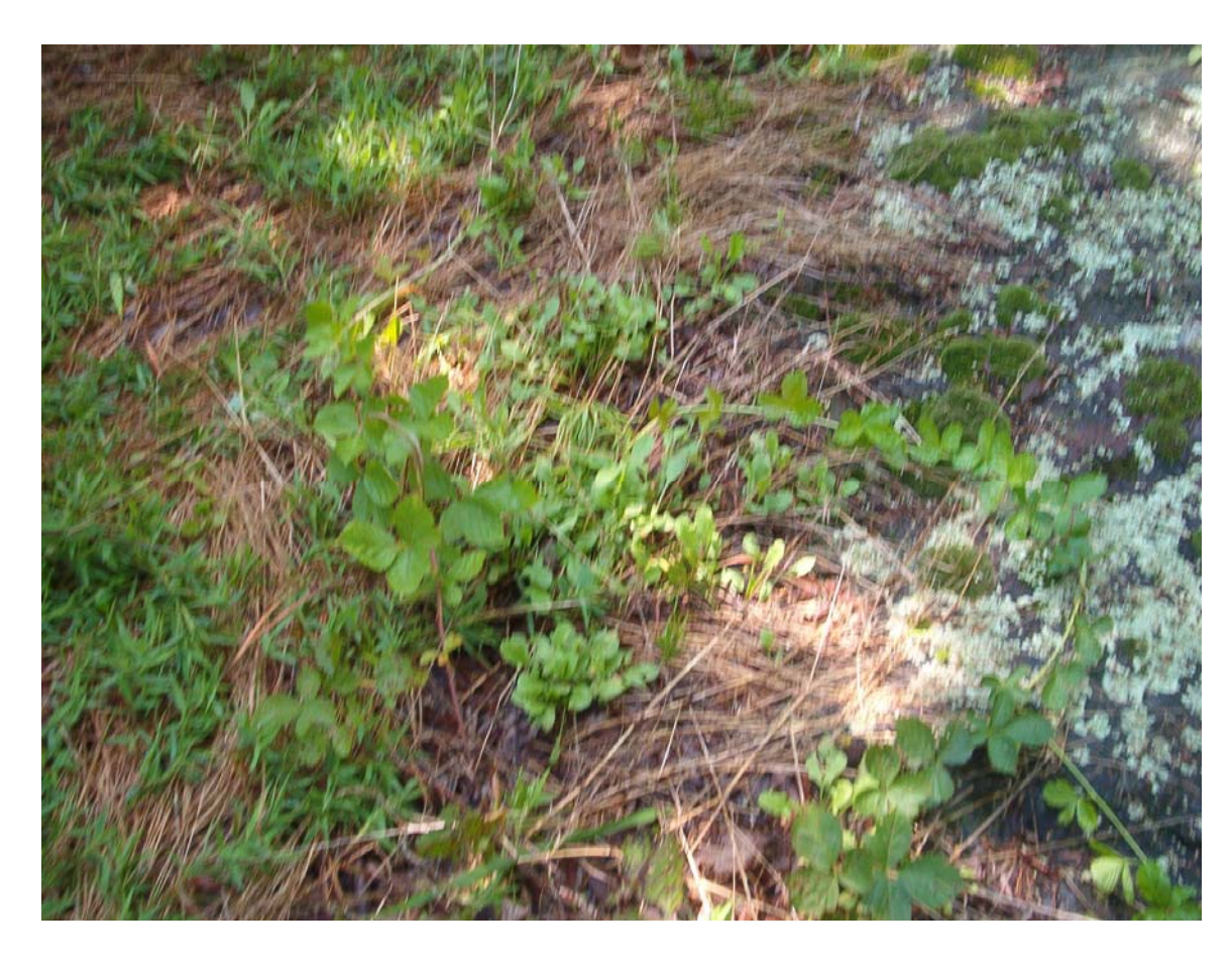
Figure 3. Encroaching vegetation at the Castle Rock site near Leanderville in Monroe County. The plants in the photograph are dewberry ( Rubus ) and a species of panic grass ( Dicanthelium ).