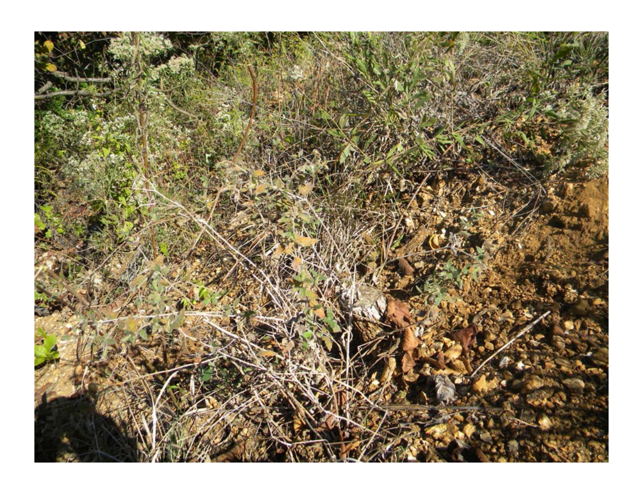
Figure 2. A plant of Mentzelia oligosperma (white stems) growing in loose gravel, talus, and loess on the slopes of Housen Hill Prairie in Pike County. This habitat is several meters in length and width, and is very steep.