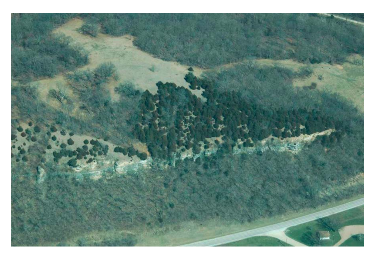
Figure 6. Aerial view of Shewhart Hill Prairie in Pike County showing the encroachment of eastern red cedar ( Juniperus virginiana ) on the hill prairie proper and other woody vegetation growing on the talus slope below the hill prairie. The narrow zone of bedrock outcrop habitat for Mentzelia oligosperma can be seen on the right and center of the photograph at the interface of the cliff and hill prairie.