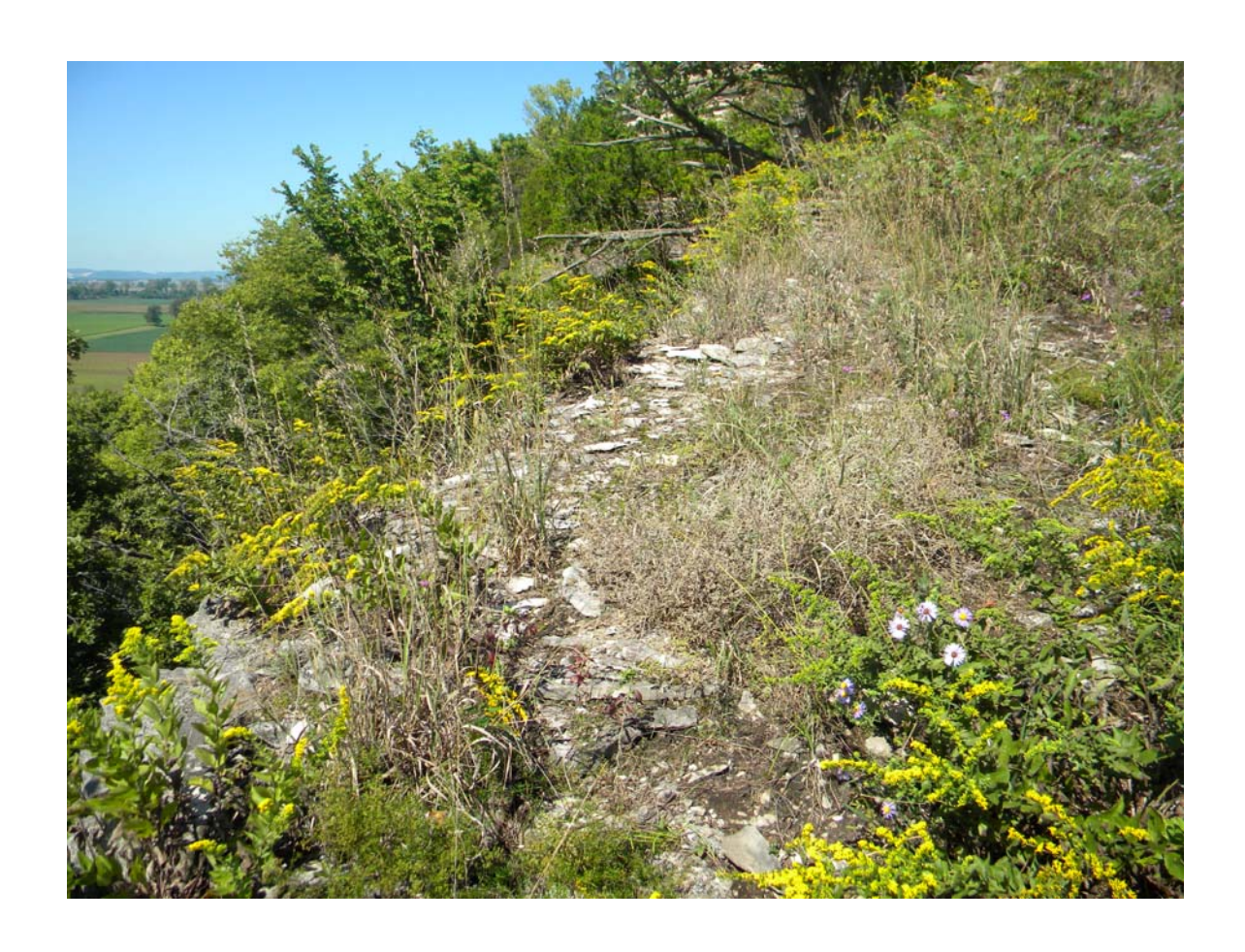
Figure 1. The narrow Mentzelia oligosperma habitat, usually not more than one meter wide, just above the cliff face. This photograph shows loose, large flakes of bedrock combined with loess in this zone. The loess hill prairie begins with the goldenrods and grasses near the center of the photograph.