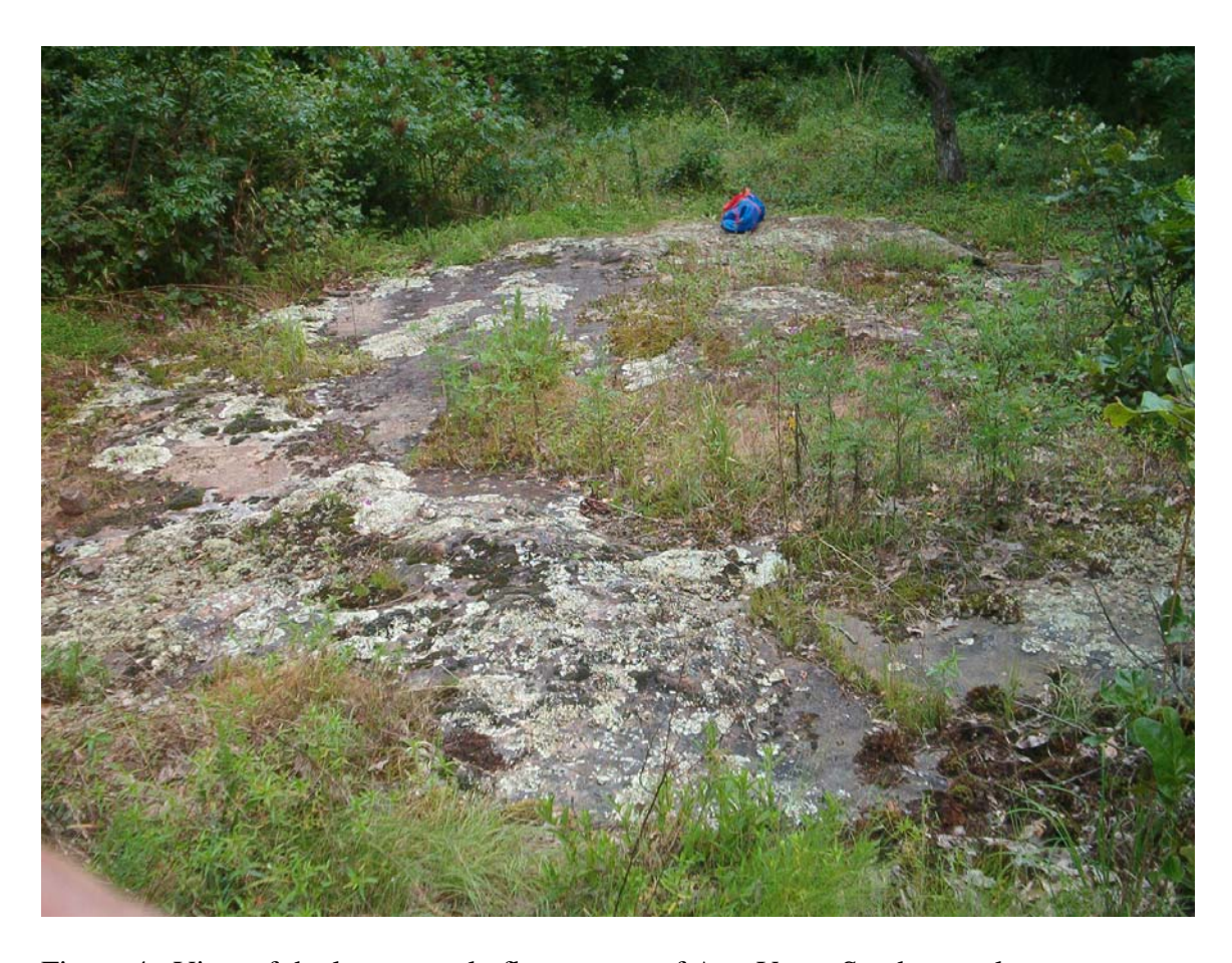
Figure 4. View of the large, nearly flat outcrop of Aux Vases Sandstone along an unnamed tributary of Horse Creek in Monroe County. Note the dense moss and lichen cover.