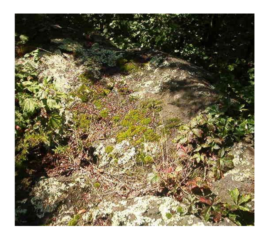
Figure 1. The "Rock" at Castle Rock near Leanderville in Monroe County. This is the historic site for Phemeranthus calycinus in Illinois, and has been known since 1954. Note the dense lichen and moss cover on the rock, and the dense shade created by adjacent woody vegetation.