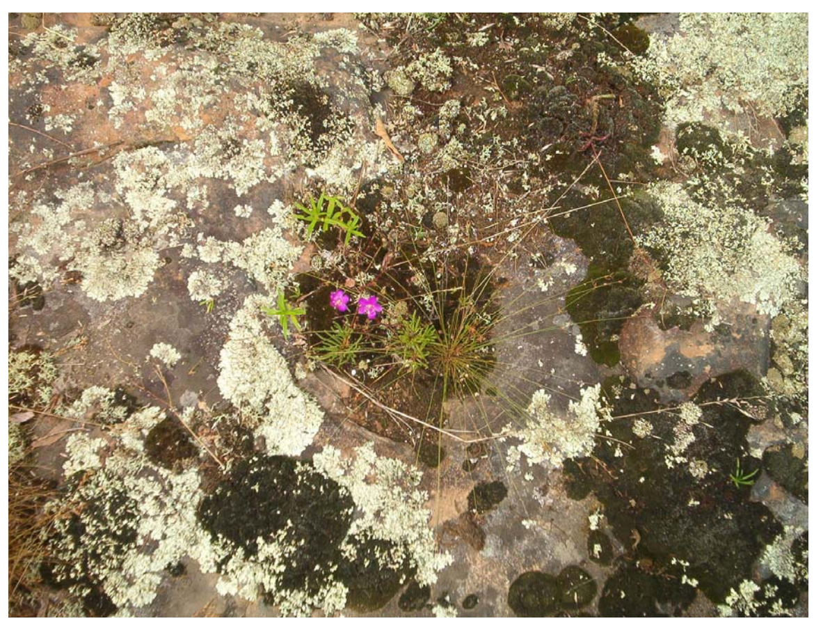
A rock pink growing in a small basin in Aux Vases Sandstone in Monroe County.

Status of Phemeranthus calycinus (Holz.) Kiger in Illinois