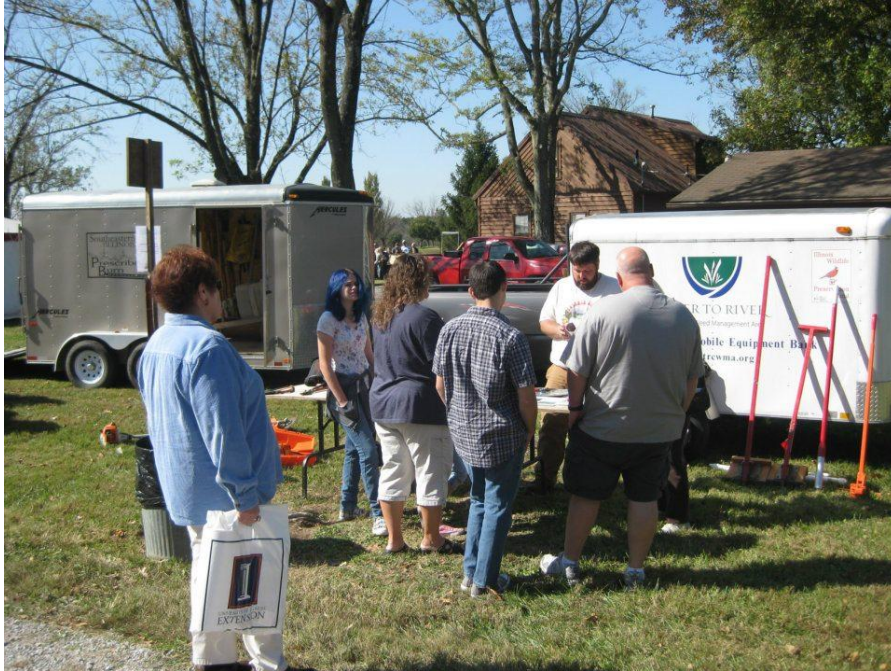
River to River CWMA's educational booth at the Sustainable Living Expo