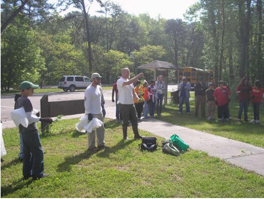
Teaching kids about invasive species