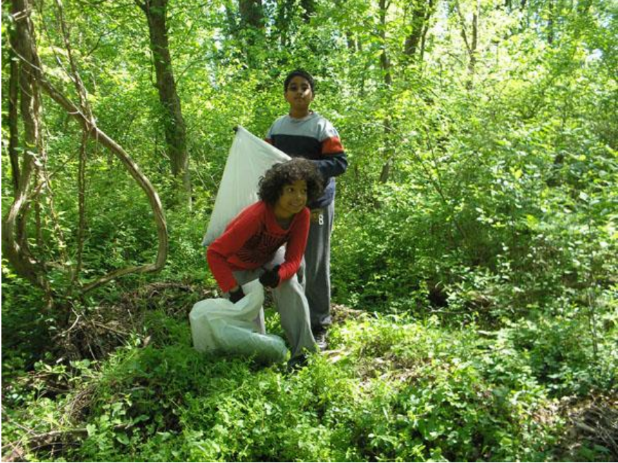
Garlic Mustard Pull Challenge