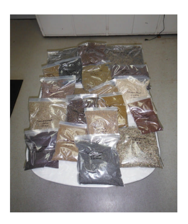
Prairie Forb Seed purchased for the Loy Prairie Project with the Wildlife Preservation Fund Grant

All of the prairie forb seed was freeze and thawed onto the prairie restoration areas on the Loy Prairie during February 2012 by volunteers; this allowed the seed to freeze and thaw into the soil which will allow for germination in the spring of 2012. Many of these prairie forb species that were purchased were specific prairie forb seed and plants that are utilized by insect species of conservation concern and were planted in an effort to establish populations of these species on the Loy Prairie. Twelve Mile Prairie is located along the east boundary of the Loy Prairie restoration, which will provide a source population for plant and animal colonization. Several Illinois species of conservation concern are known from the 12 Mile prairie corridor.