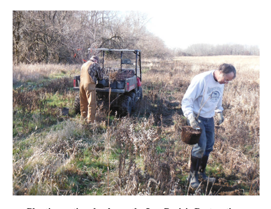
Planting native shrubs on the Loy Prairie Restoration

prior to the spring growing season. The shrubs were planted in seven different locations in two groups of 20 and five groups of 40, these groupings allow for shrub communities to be established and higher survivability. These shrub colonies should provide habitat for shrubland dependent wildlife. See attached map for locations of the shrub plantings.