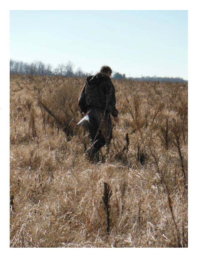
Spreading Forb Seed on the Loy Prairie Restoration

The following is a list and amounts of the prairie forb seed purchased with $3993.30 worth of grant funds. 1 lb. Aster laevis Smooth Aster, 1 lb. Astragalus canadensis Canada Milkvetch, 2 lb. Cassia fasciculata Partridge Pea. 1 lb. Coreopsis tripteris Tall Coreopsis, 1 lb. Desmanthus illinoensis Illinois Bundle Flower, 1 lb. Desmodium canadensis Showy Tick Trefoil, 1 lb. Desmodium illinoense Illinois Tick Trefoil, 1 lb. Echinacea pallida Pale Purple Coneflower, 5 lb. Eryngium vuccifolium Rattlesnake Master, 3 lb. Heliopsis helianthoides, Early (False) Sunflower, 3 lb. Lespedeza capitata Roundheaded Bush Clover, 1 lb. Liatris aspera Button Blazing Star, 1 lb. Liatris pycnostachya Prairie Blazing Star, 1 lb. Monarda fistulosa Wild Bergamot, 1 lb. Parthenium integrifolium Wild Quinine, 1 lb. Penstemon pallidus Pale Beardtongue, 4 lb. Ratibida pinnata Yellow Coneflower, 2 lb. Rudbeckia hirta Black-eved Susan, 1 lb. Silphium integrifolium Rosinweed, 2 lb. Silphium lacinatum Compassplant, 1 lb. Solidago rigida Stiff Goldenrod and 2 lb. Zizea aurea Golden Alexanders.