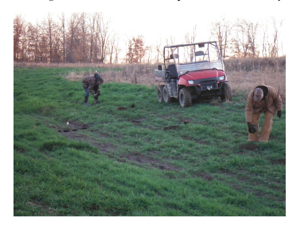
Planting prairie cordgrass plugs on the Loy Prairie Restoration in Marion County