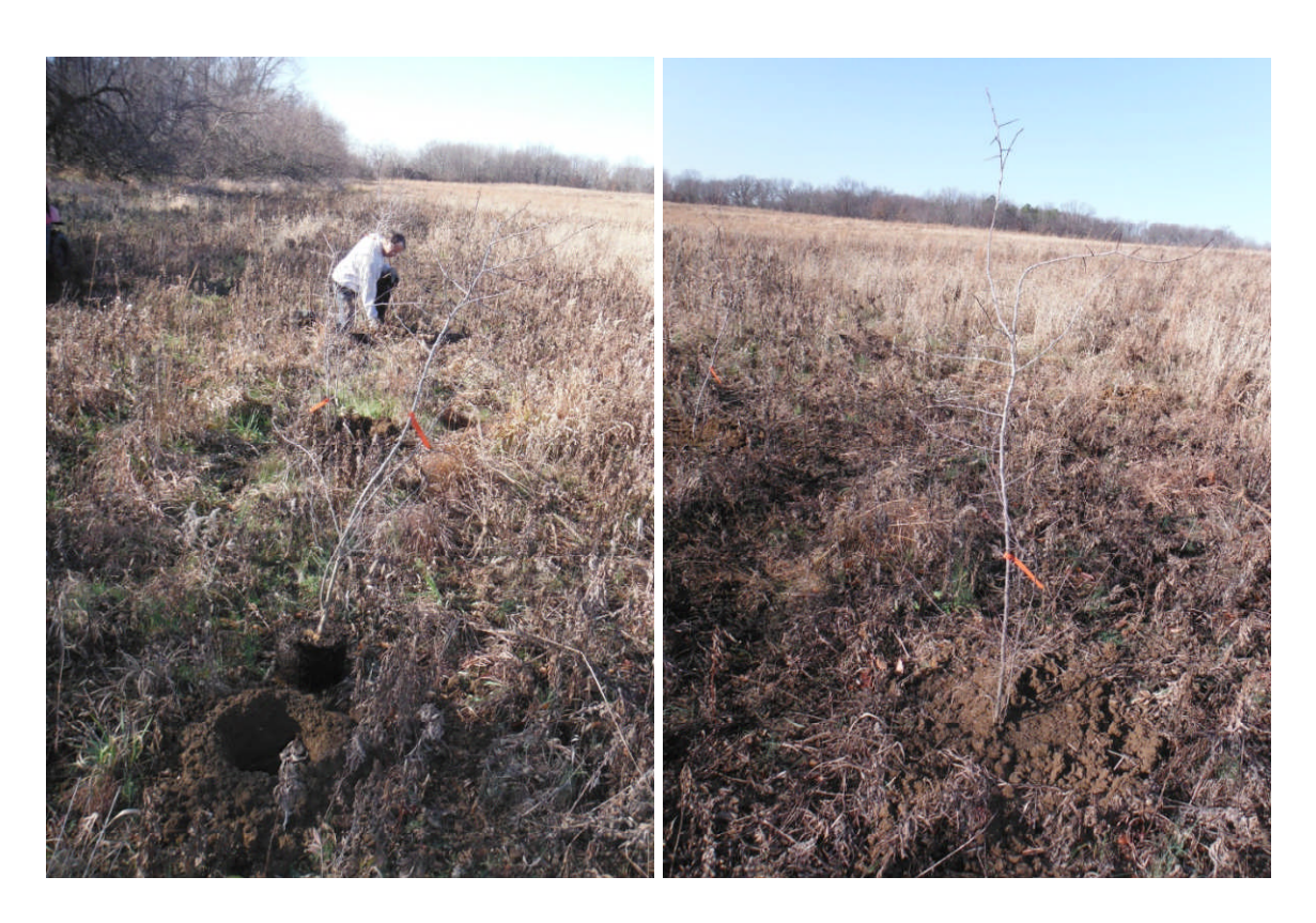
Planting a row of native shrubs and a planted shrub on the Loy Prairie Restoration