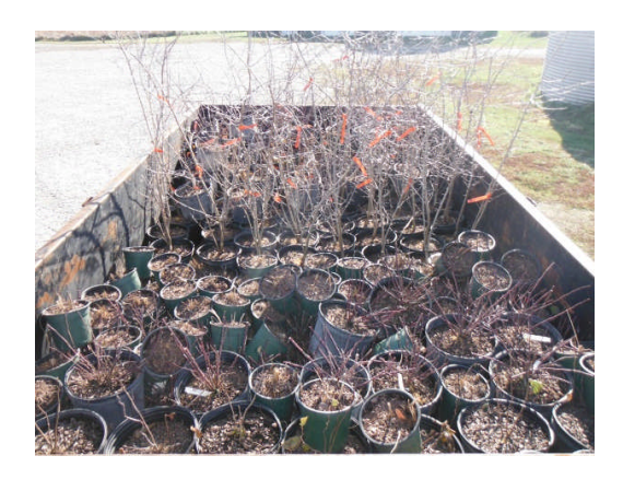
Photos of the native shrubs, grasses and wetland plants purchased with WPF monies.

All of the prairie forb seed was freeze and thawed onto the prairie restoration areas on the Loy Prairie during February 2012 by volunteers; this allowed the seed to freeze and thaw into the soil which will allow for germination in the spring of 2012. Many of these prairie forb species that were purchased were specific prairie forb seed and plants that are utilized by insect species of conservation concern and were planted in an effort to establish populations of these species on the Loy Prairie. Twelve Mile Prairie is located along the east boundary of the Loy Prairie restoration, which will provide a source population for plant and animal colonization. Several Illinois species of conservation concern are known from the 12 Mile prairie corridor.