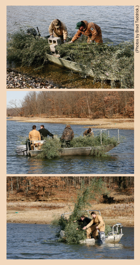
April 2007 OutdoorIllinois / 9

gram initiated to help students gain work experience in the field of fisheries, the scholarship recipient is required to volunteer with the Division of Fisheries for one summer. From 2003 to 2006, volunteers helped the district biologist conduct 31 public lake, 47 private pond and seven basin surveys, and numerous other fisheries projects. Without the assistance of volunteers, many of these surveys would not have been completed. Volunteering for the Division of Fisheries has given the scholarship recipients a better opportunity for a career in natural resources. The majority of the volunteers are pursuing a career in fisheries.