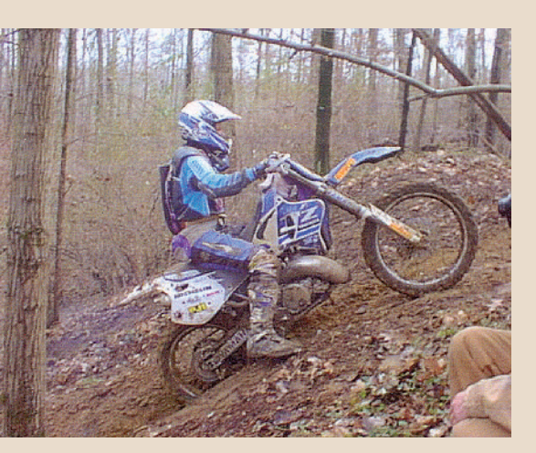
16 / OutdoorIllinois July 2006

All types of trails and terrain, from beginner to expert, can be found at the public OHV sites funded through DNR's grant program.