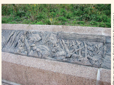
Railing at Canal Origins Park.

"Visitors traveling the towpath are transported back in time with every step they take," Hassen said. "Historic locks, locktender houses, a toll house and a grain elevator are interpreted and accessible to visitors. The communities that sprang up along the canal have historic properties that visitors may enjoy. Visiting the canal is like entering a time