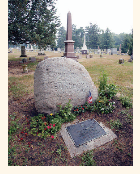
In Evergreen Cemetery at Morris, a large boulder marks the grave of Potawatomi Chief Shabonna.

day or several long weekends to exploring the trail on bike or foot, or opt for all or part of the 75-mile driving tour from Lemont to LaSalle-Peru, the I&M Canal