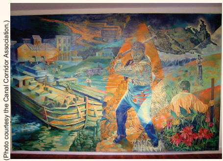
An interpretive panel in the Gaylord Building National Trust Historic Site.