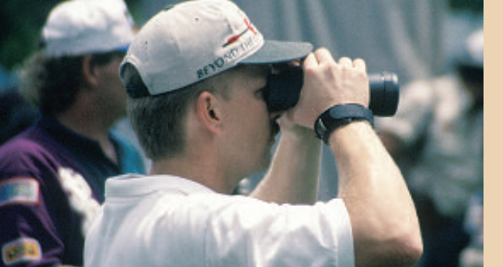
20 / OutdoorIllinois June 2005