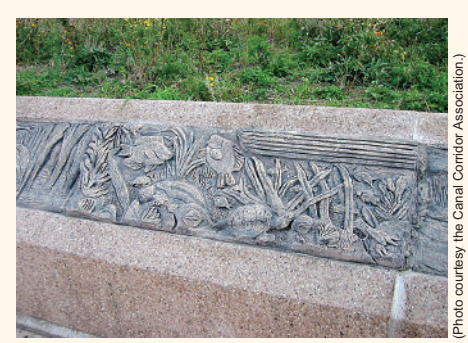
Railing at Canal Origins Park.

"Visitors traveling the towpath are transported back in time with every step they take," Hassen said. "Historic locks, locktender houses, a toll house and a grain elevator are interpreted and accessible to visitors. The communities that sprang up along the canal have historic properties that visitors may enjoy. Visiting the canal is like entering a time