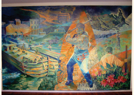
An interpretive panel in the Gaylord Building National Trust Historic Site.