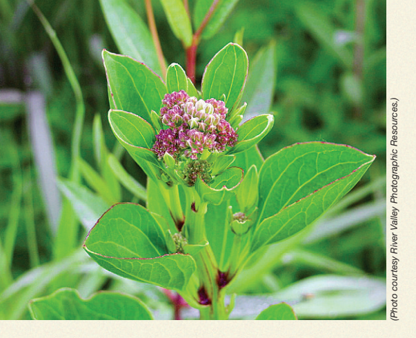
Indian plantain (Cacalia plantaginea, above) and great blue lobelia (Lobelia siphilitica) are among the showiest of the nearly 200 species of wetland plants once again flourishing at Midewin.

technologies, it became possible to mold clay tiles into complete cylinders, still called drain tiles to this day.