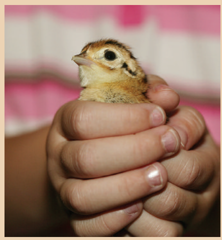
which supplies pheasant chicks to other rearing sites statewide. Public tours are available.