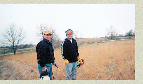
4 / OutdoorIllinois May 2008