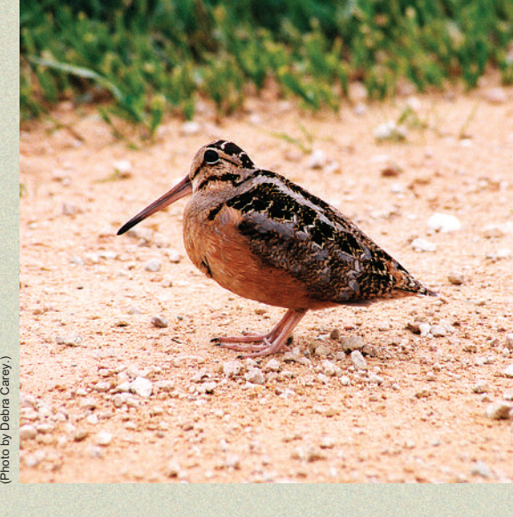
Debra Carey attributes the mating flight of the American woodcock as one of the wonders of nature that motivates volunteers.

"There aren't many places left in the state where you can stand at night and not see a light," Carey commented of the property so far from the reaches of urban light pollution that it is valued by a Chicago astronomy club. "If you want to see wonderfully dark, star-filled skies, come to Green River."