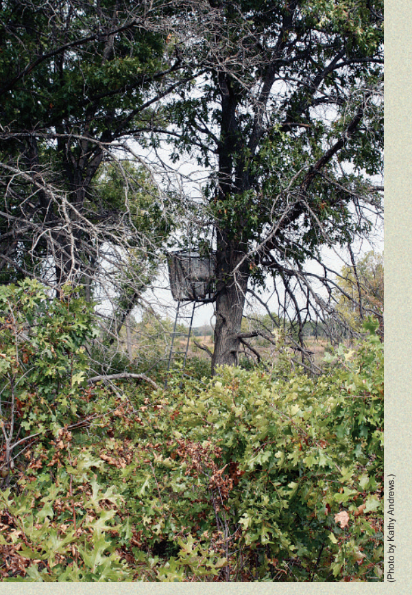
Green River is popular with archery deer hunters. The site offers other hunting opportunities, including upland game, turkey and squirrel.

ner, all typical of sand prairies, and Blanding's turtle, a species of wetland communities.