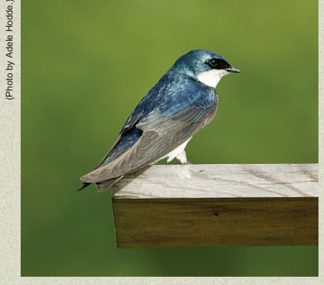
2 / OutdoorIllinois May 2008

"A few years ago I had a chance to sit in a blind in Wisconsin during