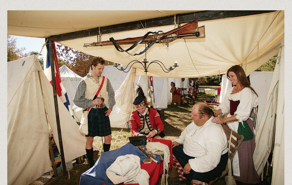
4 / OutdoorIllinois November 2008

The Department of Natural Resources, now charged with oversight of the park's 1,450 acres, began researching the possibility of rebuilding