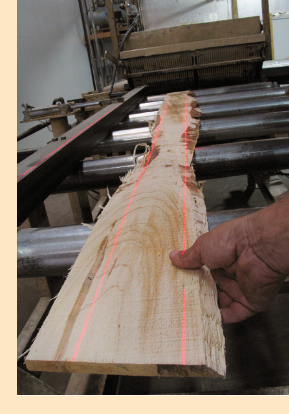
Laser beams reduce waste for precision cuts at a modern Illinois sawmill.

offering a price to woodlot owners, hoping that only a small percentage of timber that appears to be healthy is, in fact, not plagued by a heartwood rot.