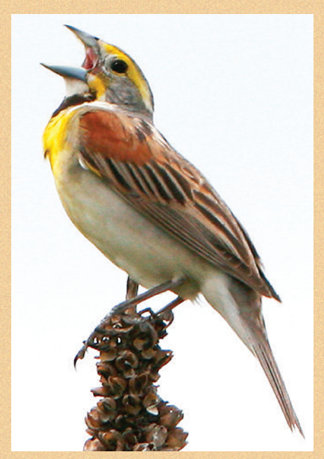
October 2007 OutdoorIllinois / 9