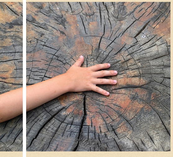
12 / OutdoorIllinois October 2008

viduals who have made significant commitments to natural resource protection and outdoor recreation in Illinois (see side bar). Nominees may include those outdoor sportsmen and women who have made significant contribu-