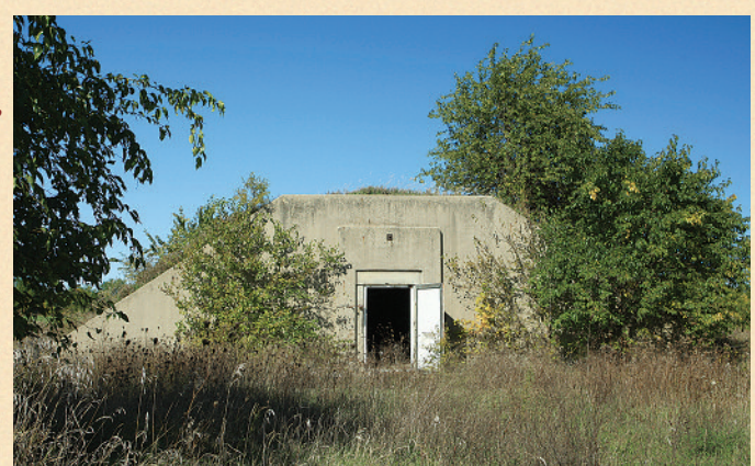
Sod-covered storage bunkers, or "igloos," remind visitors of the wartime significance of Midewin.

Settling on the Bunker Field Trail to begin exploration, I made my way down paths now lined with native plants that teemed with butterflies. Knowledge of the urgent and secretive nature of what had taken place here