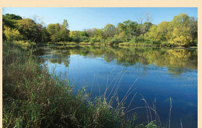
Untouched and isolated for more than 60 years, buffer areas around the ammunition plant retain their natural character.

grass preserve, and it is no small parcel tucked into an out-of-the-way corner. It encompasses 18,094 acres, 7,200 of which are now open to the public, and choosing a starting point for exploration from the 22 miles of trails can be daunting. The site map identifies trail names that jar perception and