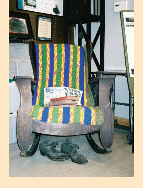
Charles Perdew's rocker, boots, books and magazines appear just as he may have left them after relaxing after a day in the workshop.

The Charles Perdew Museum, built on the footprint of the original workshop, contains interesting memorabilia, including a 1940 letter from Eddie Bauer.