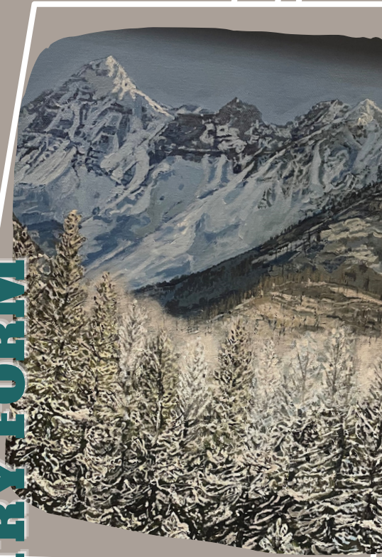
BEST OF SHOW BY KATE BATKIEWICZ