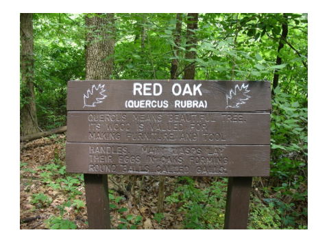
Please take only pictures and leave only footprints. Please stay on designated trails. Poison ivy exists on this trail.

All plants, animals, and artifacts are protected by law in your state parks.