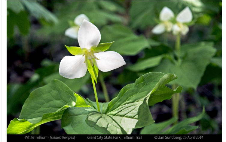
White Trillium ( Trillium flexipes ) Giant City State Park, Trillium Trail © Jan Sundberg, 25 April 2014

Length: 2 miles Difficulty: Rugged Walking Time: 1 hour