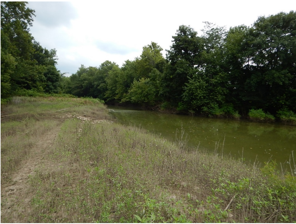
Plate 5. Station 07-4P South. This was the only location where a Spiny Softshell was captured.