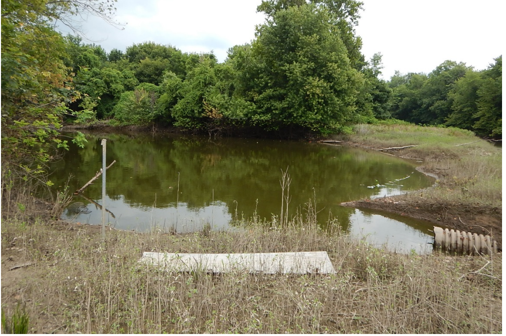
Plate 4. Wetland sampled as 07-4P North at ERBSHA. Note one of the coverboards is visible in the foreground of the image