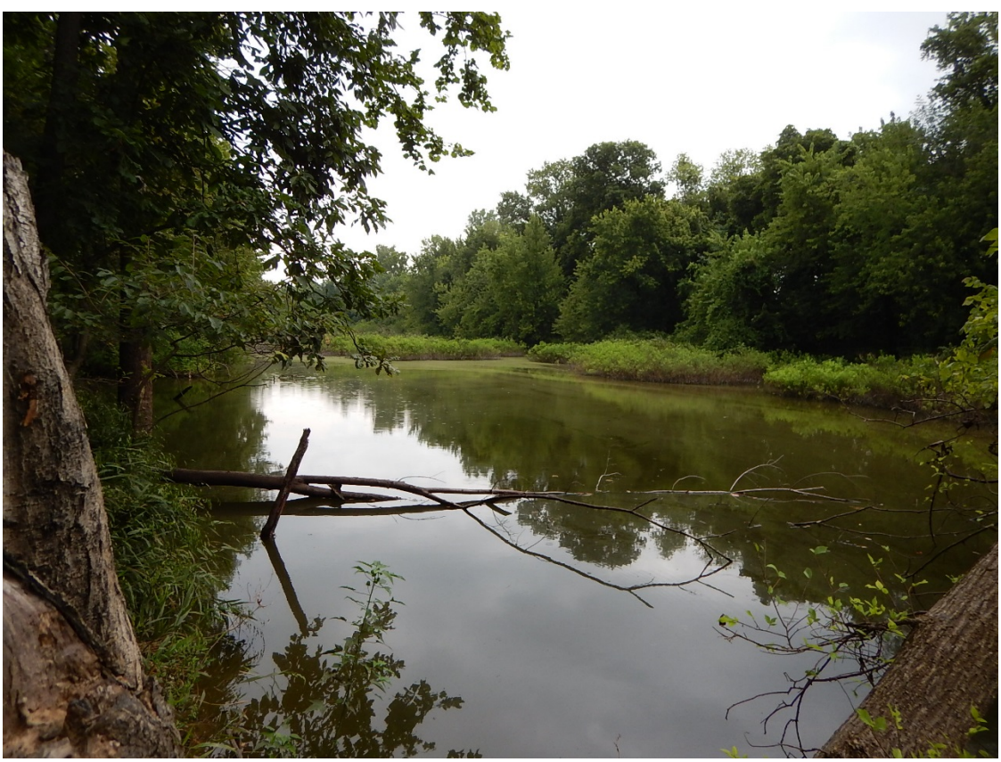
Plate 7. Replacement location for monitoring station R16-1T. Denoted as R16-1T North in Table 1.