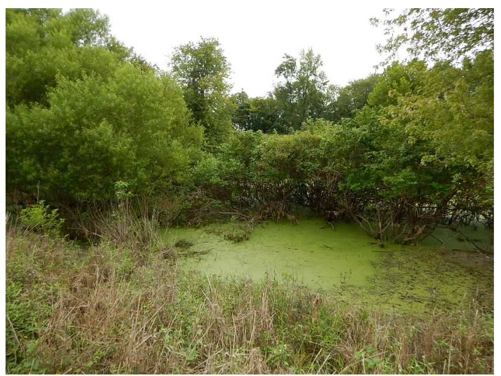
Plate 2. Wetland at 07-2P East in ERBSHA.