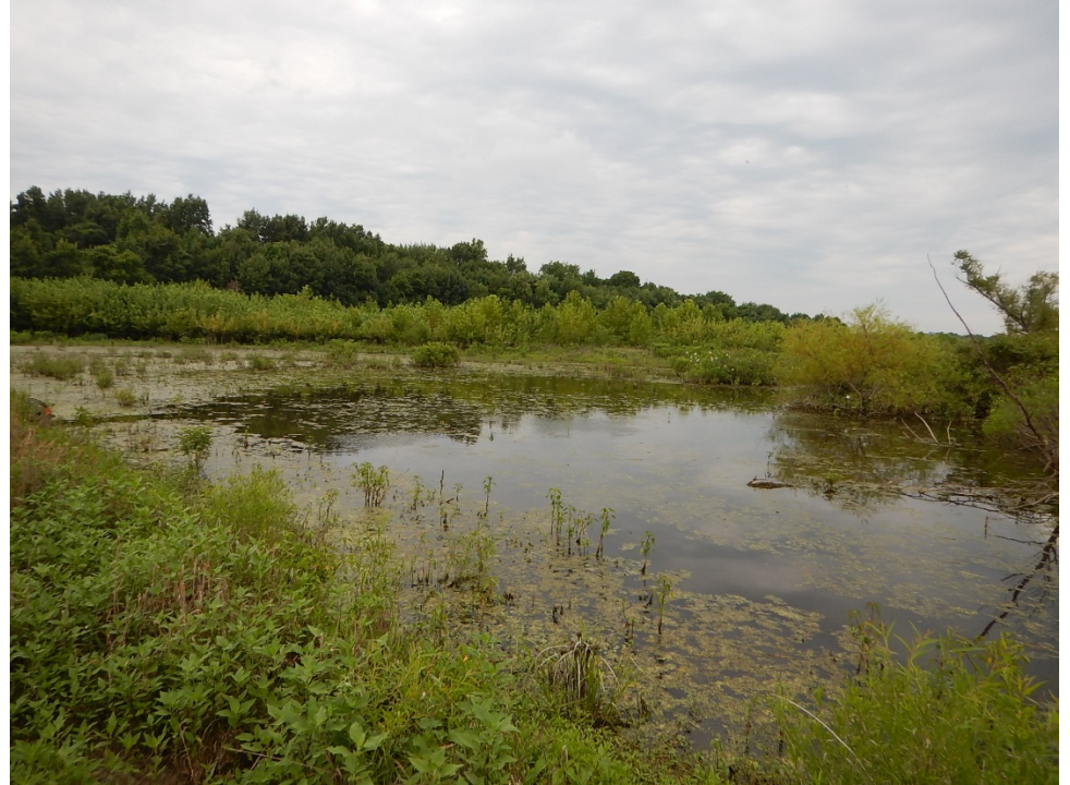
Plate 1. Wetland at station 07-2P West in ERBSHA