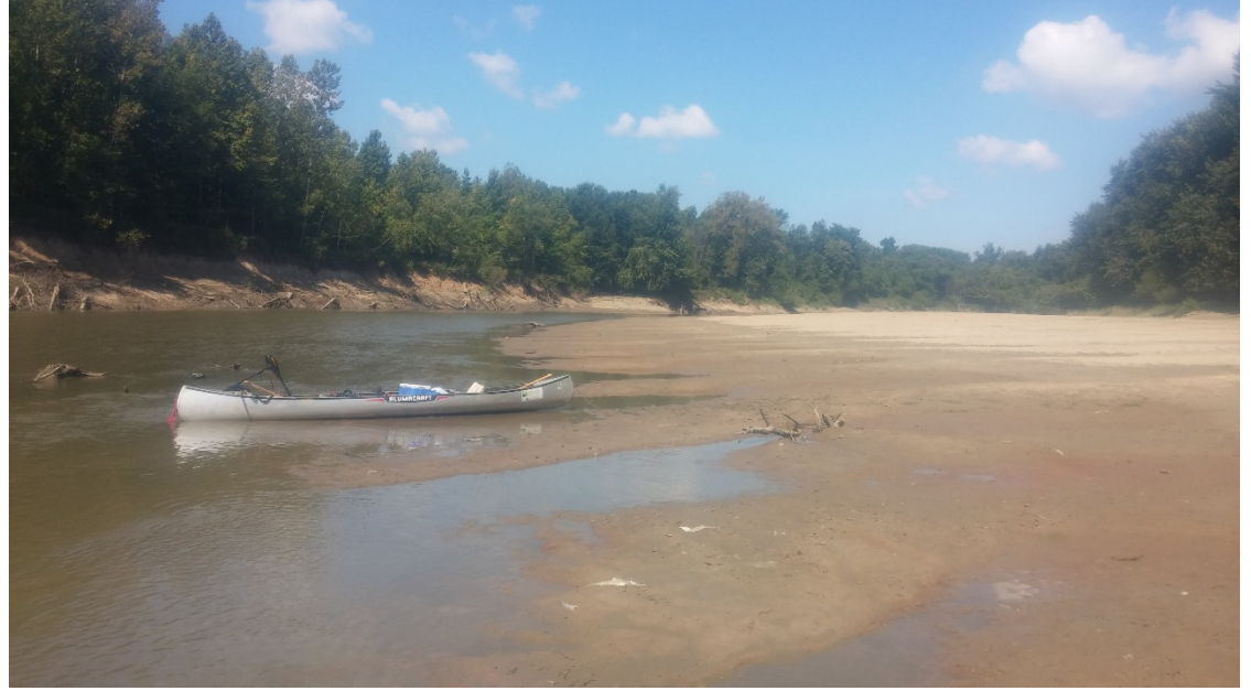
Plate 8. One of the five sand bar sampled on the Embarras River during the second two rounds of sampling at ERBSHA in 2015. Numerous Smooth Softshell turtles were captured at this sandbar.