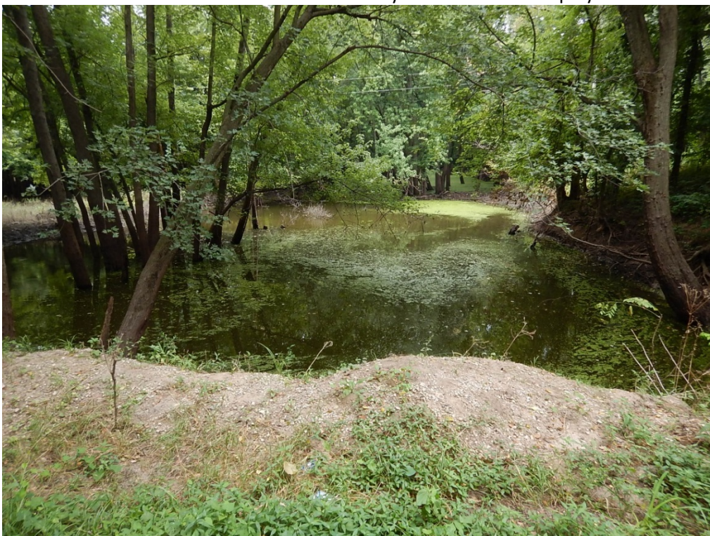
Plate 6. Original location of sampling station R16-1T. It is denoted as R16-1T South in Table 1. The traps were stolen from this location so the site was changed to that depicted in Plate 7.