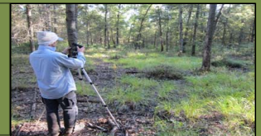
Photo stations will be established to visually track the habitat changes over time. At each station, the latitude and longitude will be recorded and identified with a marker of some type. A photo will be taken in all four cardinal directions.

As part of a statewide species recovery effort, a barn owl nest box has been erected at the site. This box will be monitored as part of the statewide effort.