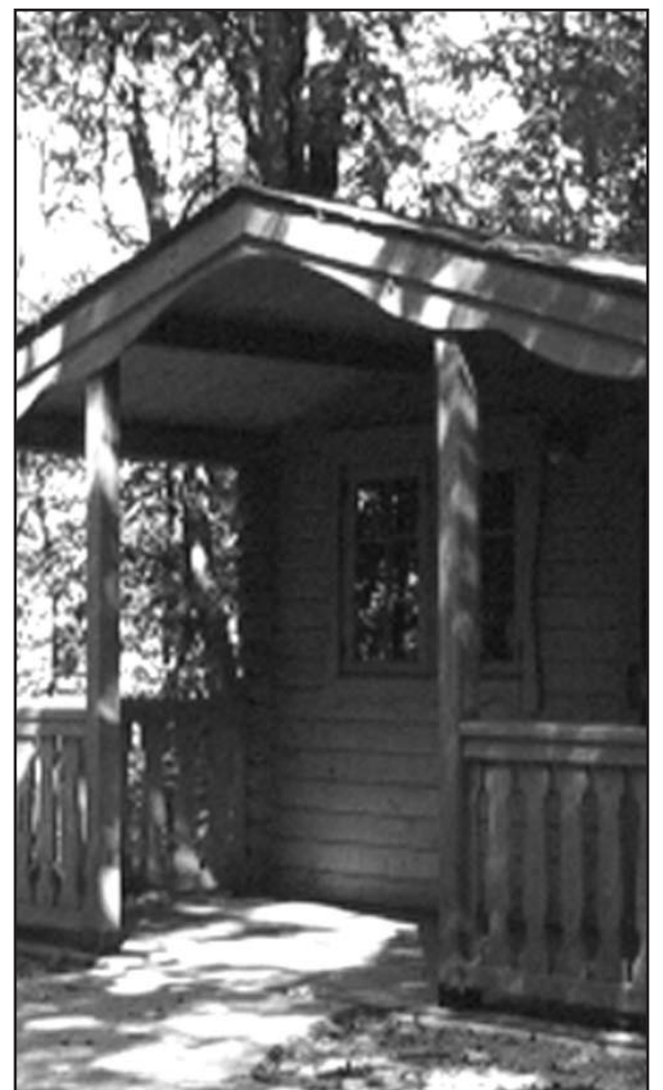
WOLF CREEK STATE PARK