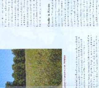
GRAND ITATIONS TRAIL CONCEPT