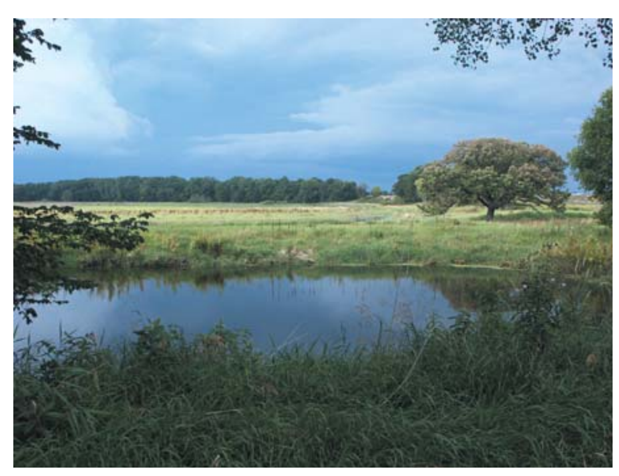
Nygren Wetland Preserve, Natural Land Institute

The Greenways Plan is a tool to help communities steer growth and development away from valuable natural resources and toward existing communities and infrastructure. Rapidly increasing urbanization in both counties threatens stream corridors and other natural resources that are essential to the health of the region. The scientific data represented in the apdated Greenways Plan Map and complementary database provide a valuable resource for community leaders and individuals making decisions about which areas are appropriate for development and which are to be prioritized for protection. Extensive GIS (Geographic Information System) data including hydrology, soil types, floodplains, geology, topography,