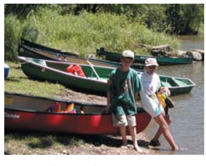
Distillery Road Conservation Area, Boone County Conservation District