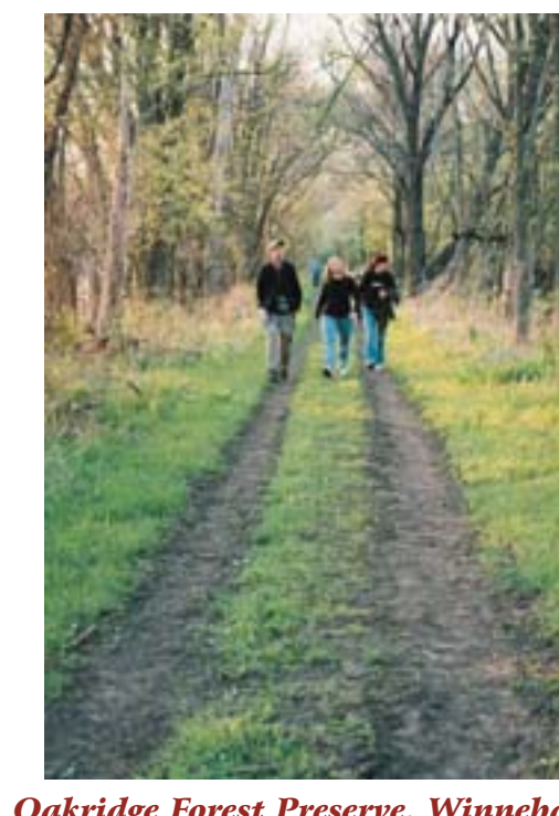
Oakridge Forest Preserve, Winnebago County Forest Preserve District

In addition to the numerous restored natural areas, there are six designated Illinois Nature Preserves within Winnebago County forest preserves: Sugar River Alder, Colored Sands, Pecatonica Bottoms, Hartley Memorial, Laona Heights, and Severson Dells. Other nature preserves in Winnebago County include Searles Prairie, Harlem Hills, and Colman Dells. Boone County contains three: Flora Prairie, Ispen Prairie and Kinnikinnick Creek. These dedicated nature preserves are areas of land or water in public or private ownership that are formally dedicated to protect and preserve their natural character. Many nature preserves contain state threatened or endangered species and many contain rare or critical habitat. Nature preserves within the forest preserves and conservation areas are open to the public for hiking and nature observation.