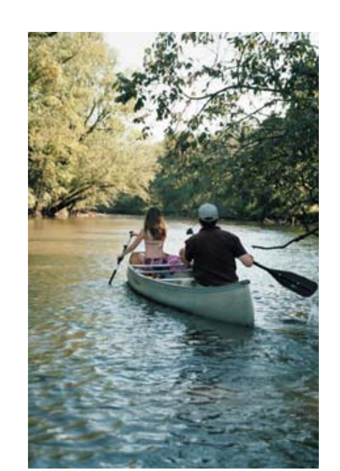
Sugar River Forest Preserve, Winnebago County Forest Preserve District

corridors have been created along river and stream corridors. These corridors are critical to protecting water habitat quality, protecting biodiversity along the streams and creating recreation trails for hiking, horseback riding and canoeing. The region offers a unique network of riverside parks, forested shoreline, campgrounds and designated boat landings that make it a favorite destination for recreationalists and nature lovers. Many forest preserves are located on the area's four rivers and offer canoe launch areas, as well as amenities like parking, outhouses, water and picnic areas. To enable residents and visitors to find and safely enjoy canoeing and fishing activities, the Winnebago County Forest Preserve District and the Rockford Park District have produced a comprehensive Boating, Fishing & Canoeing Guide which covers all recreational water facilities and regulations in Winnebago County. To receive a copy of this free brochure, call the Forest Preserve Distric at (815) 877-6100, or access www.wcfpd.org.