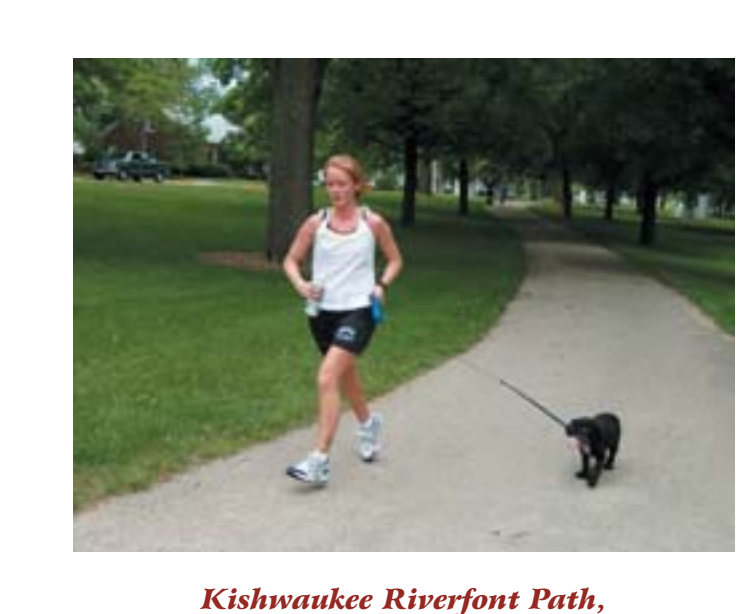
Belvidere Park District