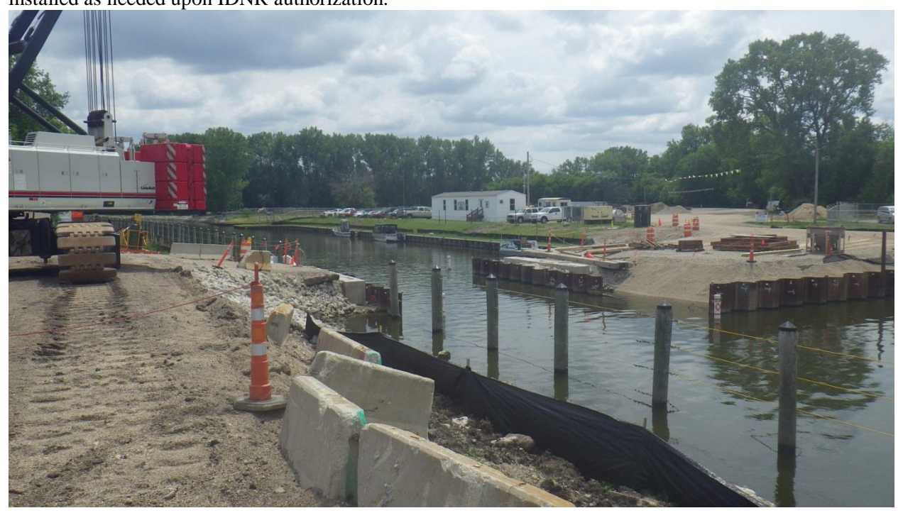
North Berm work is complete.

Temporary construction access bridge deck has been removed for boating season. Deck can be reinstalled as needed upon IDNR authorization.