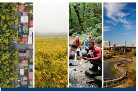
Local Mitigation Planning Policy Guide

FP 206-21-0002 Released April 19, 2022, Effective April 19, 2023 OMB Collection #1660-0062