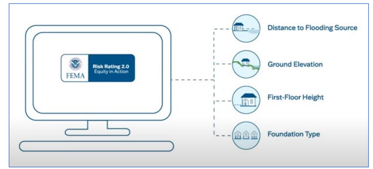
Clip from the new FEMA video explaining key factors for determining cost of flood insurance policies with Risk Rating 2.0.

FEMA recently developed a nearly 6-minute video, <u>Risk Rating 2.0 - Equity in Action: FEMA's New Rating</u> <u>Methodology</u>, which covers the main factors used in the new methodology for determining flood insurance premiums. Share with your residents if they are confused by the new premiums.