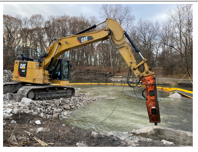
Touhy Avenue Dam Removal

In 2021, Dam 4 and Touhy Avenue Dam, both located on the Des Plaines River near Rosemont, and the Buzzi Unicem Cement Plant Dam, located near Ogelsby on the Vermilion River, were removed. Removing Dam 4 and Touhy Avenue Dam significantly improved the health of the waterway,